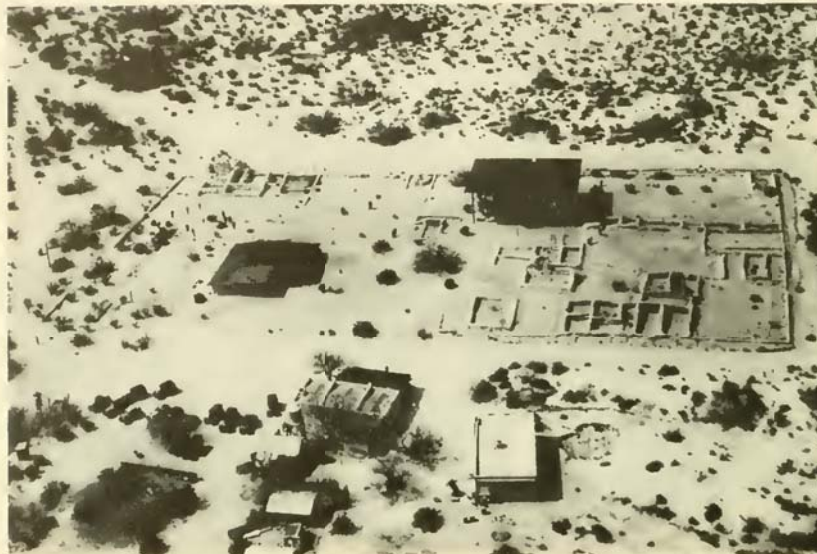
FIG. 4. Aerial photograph, 1930, showing Casa Grande in relation to adjacent prehistoric ruins.