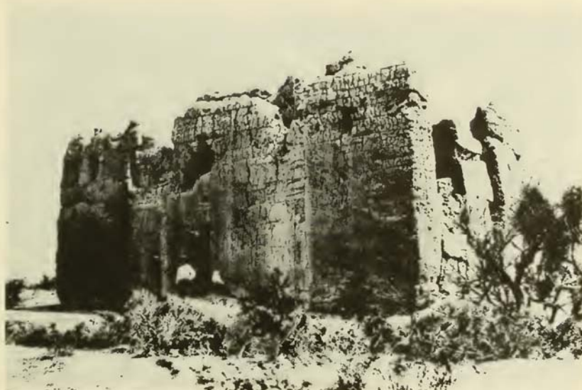
FIG. 3. Appearance of Casa Grande Ruins in 1878. (Dark growth on trees is mistletoe.)

deepened. However, an infestation of mistletoe was believed to be partially responsible.