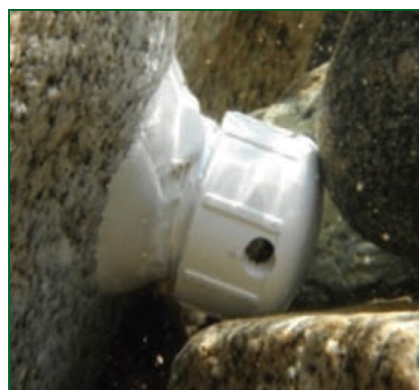
A PVC canister assembled with epoxy is attached to a large rock so that the downstream surface is shielded from moving substrate and debris.