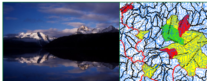
The primary objective for Sawtooth N.F. was to determine what influence climate change will have on threatened bull trout populations. The vulnerability rating resulting from this process (i.e. the extinction risk for bull trout) predicted bull trout persistence in subwatersheds by 2040.