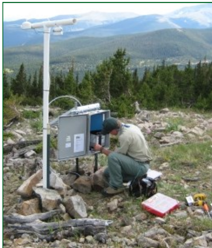
RMRS researchers are using a portable battery powered monitor to evaluate ozone at Trout Creek Pass, Colorado and several other high-elevation locations in the Rocky Mountain West.

Management Implications: There were significant year-to-year differences in O 3 concentrations at each of the remote locations studied, but even in low O 3 years some of these sites had concentrations above the National Ambient Air Quality Standard. The large number of mid-level O 3 concentrations contributed to a high W126 cumulative O 3 exposure index, a secondary standard proposed to protect sensitive vegetation. This suggests that the proposed W126 secondary standard would be difficult to achieve at most remote national forest sites and other rural locations in the western U.S. These findings will allow National Forests to determine O 3 levels in remote areas, determine if O 3 at these sites exceed the federal standard, and examine long-term changes in O 3 in remote regions.