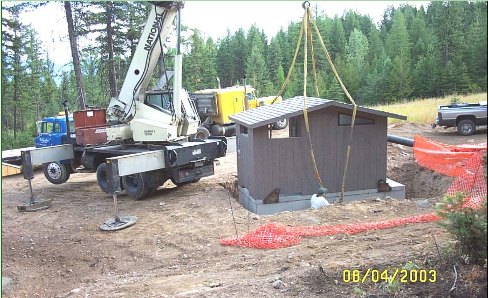
XC Ski area restroom