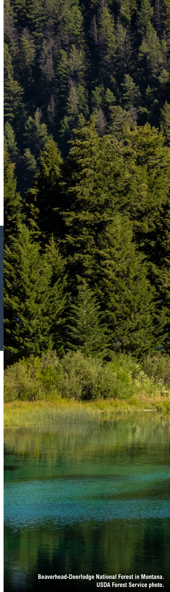
Beaverhead-Deerlodge National Forest in Montana.

What is meant by the alignment of the 4-Ps?