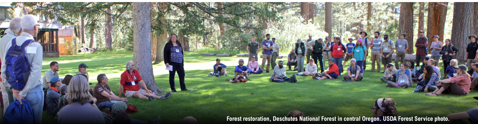
Forest restoration, Deschutes National Forest in central Oregon.

To develop a collaborative environment requires significant commitments of time, energy, and resources by all the individuals and groups involved, including the Forest Service. In short, collaboration does not happen without a significant investment of time, energy, and financial costs borne by all those who participate. Therefore, it is imperative that citizens’ collaborative groups function as effectively and efficiently as possible to honor the time, investment, and commitment of those involved.