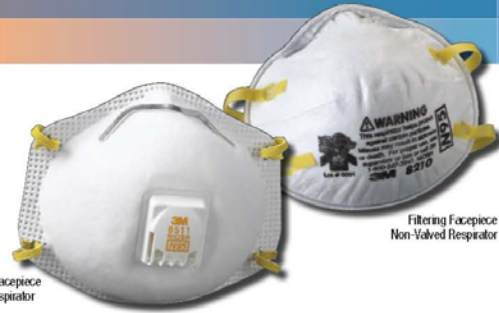
Filtering Facepiece Valved Respirator

Using both hands starting at the top, mold the metal nose clip around your nose to achieve a secure seal.