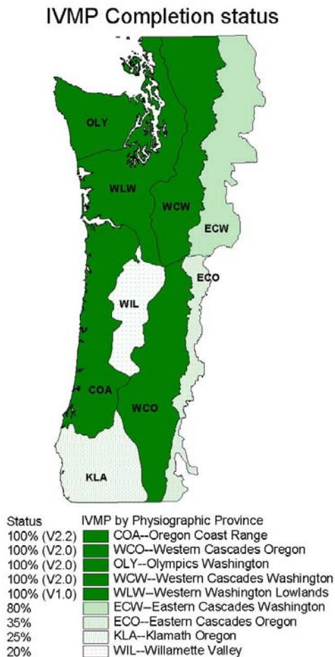
Figure 2. IVMP completion status, as of March 30, 2002.

As of March 30, 2002, IVMP data has been released for five provinces—Oregon Coast Range, Western Oregon Cascades, Olympic Peninsula, Western Washington Lowlands and Western Washington Cascades (Figure 2). IVMP thematic map data, documentation and accuracy assessment are distributed on CD (Browning and others 2002; O’Neil and others 2001) and are also downloadable from a BLM website ( http://www.or.blm.gov/gis/projects/vegetation/ ). Eastern Washington Cascades is 80% completed. Target completion date for all remaining provinces (Eastern Oregon Cascades, Oregon Klamath, and Willamette Valley) is by end of CY 2002.