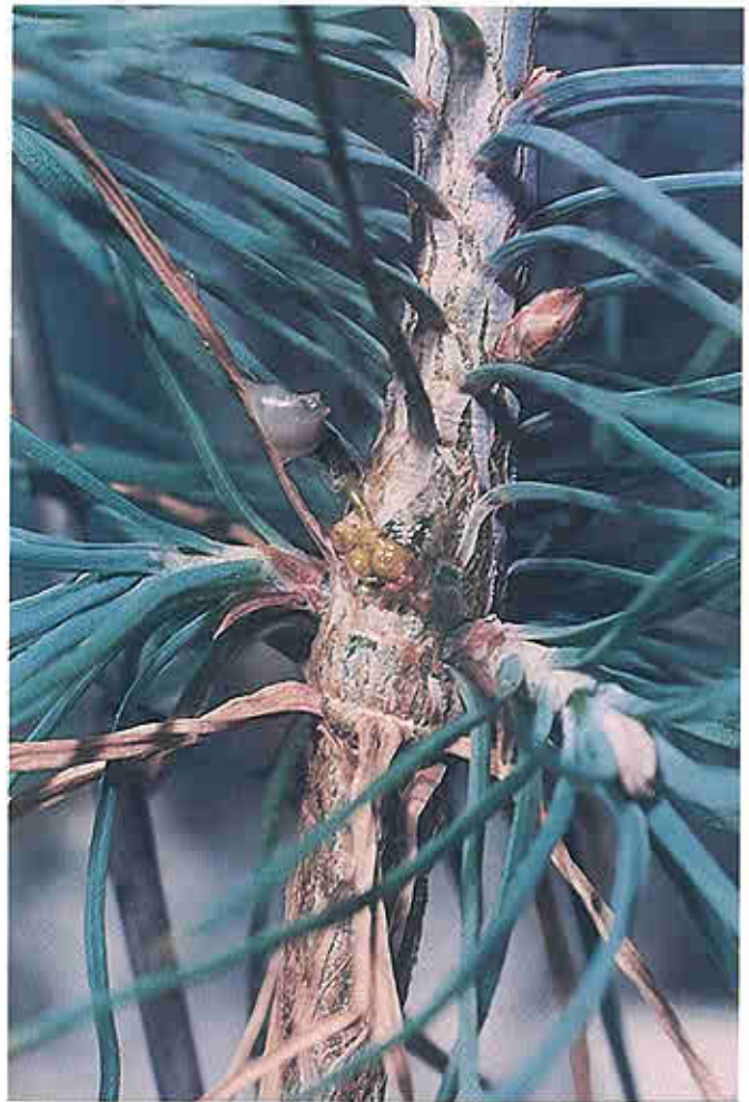
Figure 6 —Localized branch swelling and the presence of small buds of the parasite are the first symptoms and signs of infection by dwarf mistletoe. Note that the dwarf mistletoe seed is often still present when symptoms appear.

No marked differences were noted in the development of dwarf mistletoe shoots among the sources tested. At least some plants on some trees from all sources were showing early signs of shoot development within 2 years after inoculation (fig. 6). By the third year after inoculation, most of the young plants bore either developing shoots or buds pushing through the bark on the swollen portion of branch tissue. Some infections remained latent within branches and did not appear until three or more years after inoculation, however. A major complication arose in attempting to follow the development of shoot and fruit production of the dwarf mistletoe plants. In summer 1984,