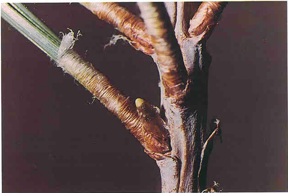
Figure 1—A moist seed of dwarf mistletoe placed on a branch at the base of a needle fascicle.

In 1981, the same 150 trees were inoculated again at Mt. Danaher. This time, 10 seeds were used on each of three different branches for a total of 4500 inoculations. One branch on each tree was enclosed in an "insect-proof" mesh bag, one was enclosed in a "bird-proof" mesh bag, and one was left exposed as before (fig. 2). Insect- and bird-proof bags were used in this test because the 1980 inoculations showed that heavy seed loss occurred before seeds could germinate and infect the host. We attributed this loss to either predation by insects or birds or both.