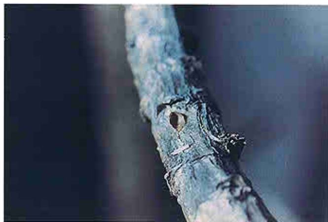
Figure 3 —Only a portion of the seed coat of a dwarf mistletoe seed remains on the surface of a pine branch, suggesting the seed had been eaten by a bird or an insect.

For the three sources inoculated in 1981 at Mt. Danaher, seed loss after 5 months again appeared heavy on unbagged branches, but an analysis of variance showed no significant differences in mean percentage loss among the sources. On the other hand, average seed loss from uncovered branches on the Laguna Mountain source at the Fruitridge plantation was significantly lower than any of the sources at Mt. Danaher. A