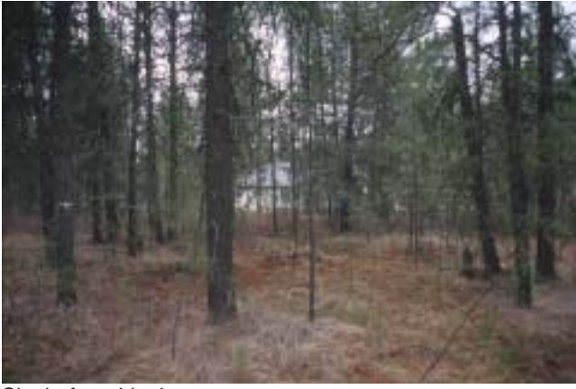
Site before thinning.