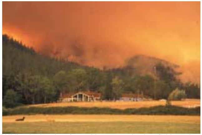
Wildland-urban interface—Llamas grazing in a field watch as a wildfire comes close to home on the Deer Creek Ranch outside of Selma, OR.

probability that a prescribed fire will have excessively severe impacts or undesired results.