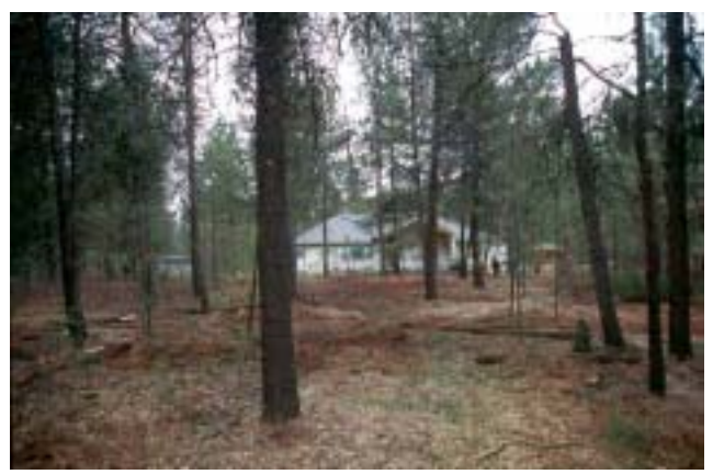
Site after thinning.

Branches, limbs, and other slash may need to be treated with prescribed fire.