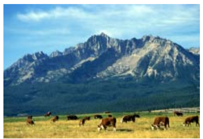
Grazing reduces surface fuels, which, in turn, decreases the incidence of wildland fire.

The effects of decreased fire occurrence on fuels and fire behavior vary from site to site. In the