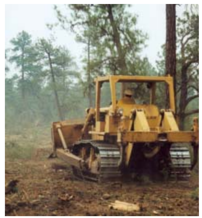
A bulldozer operator knocks down trees to create a safety zone for firefighters and fire equipment south of Show Low, AZ.

Another approach to managing fire on a landscape scale is the use of fuel breaks in strategic locations, such as along ridgelines or around communities. The concept behind fuel