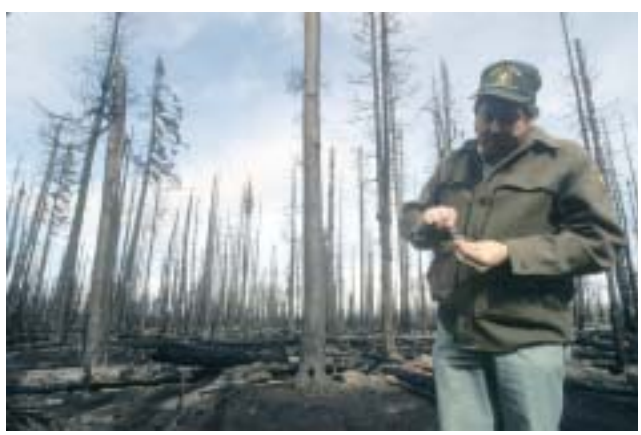
Fire research can help determine the best treatment regimes for specific forest types, climates, soils, and other factors that influence forest health.

Forest thinning and prescribed burning are two land-management techniques long employed by foresters and others to maintain forest health and reduce wildfire risk. The benefits of these practices are supported by hundreds of scientific investigations and years of professional field experience. These practices can be effectively combined in treatment regimes to improve forest health and reduce wildfire risk, while providing social and economic benefits. A science-based program of fuels management can reduce wildfire