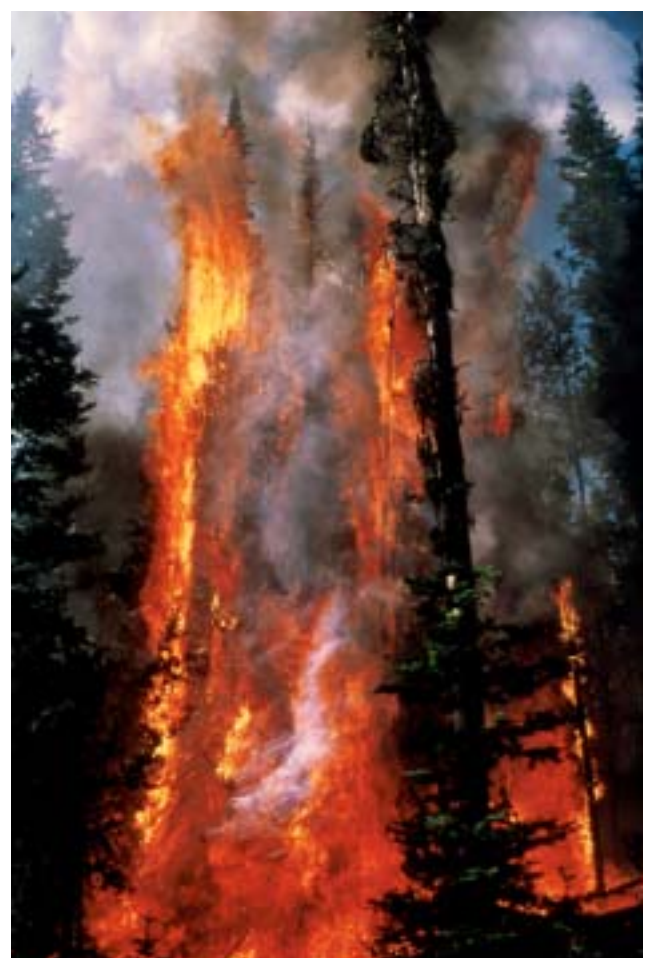
Wildland fire flames of the Monument Fire, OR, 2002.