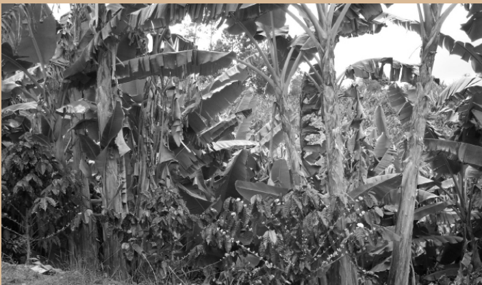
Coffee flowering under the shade of plantain in Puerto Rico

RICHARD STRAIGHT ADAPTED FROM NRCS FACT SHEET, MANAGING SHADE COFFEE, NOV 2012