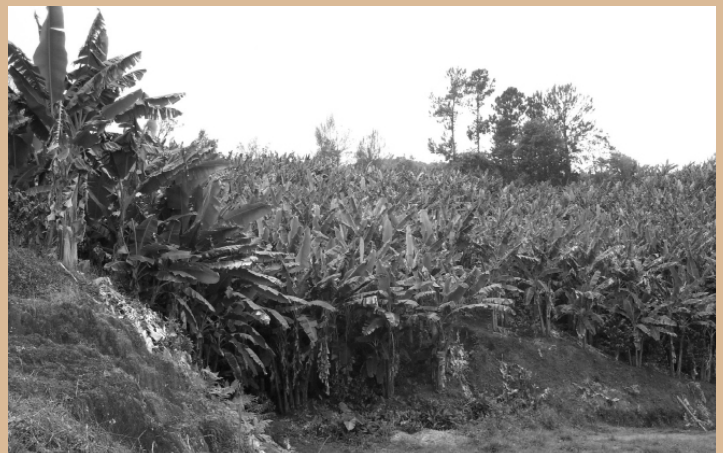
Coffee and plantain provide a protective canopy at the top of the watershed that creates habitat and reduces erosion.

Please contact the NRCS Field Offices or the State Office in San Juan, Puerto Rico, at 787-766-5206, or visit our Web site at: www.pr.nrcs.usda.gov . 🌱