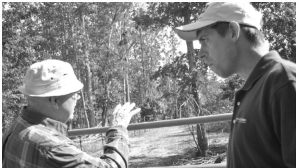
The field trip provided lots of opportunities for questions and discussion. -