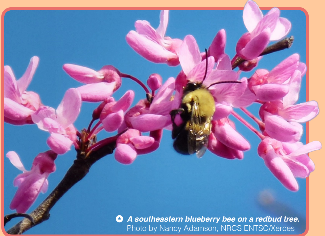
▲ A southeastern blueberry bee on a redbud tree.

Over one hundred crop species in North America require a visit from an insect pollinator to be most productive. In the past, native bees, feral honey bees, and other pollinators could meet the needs of these diverse crops because farms were typically interspersed with pollinator habitat. Today, farms in the U.S. are larger and have less nearby habitat to support pollinators.