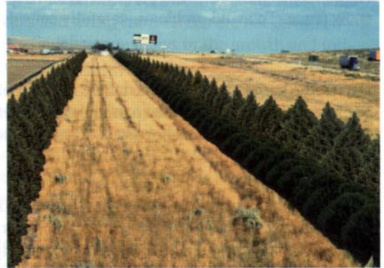
Photo on left: Trees and shrubs 2 years old. Photo on right: Trees and shrubs 20 years from now.

"The Most Dangerous Freeway in America" is how USDA Today described the 41-mile stretch of Interstate 84 that runs from near Burley, Idaho, southeast to Salt Lake City, Utah. When the wind blows, snow and dust can cut drivers' visibility to zero. A local task force studied the problem and decided to test a living snow fence on a 2.5-mile section of the highway.