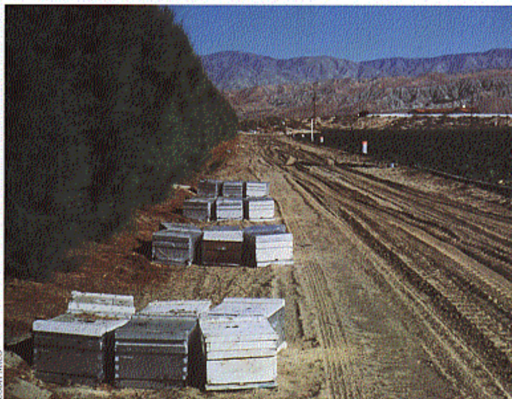
Windbreaks can provide favorable microclimate conditions for pollinating insects, increasing yields of many vegetable and fruit crops.

One of the more common handicaps of field windbreaks is the impact of competition between the windbreak and the adjacent crop. There is no question