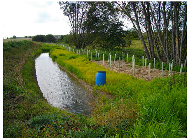
Fig. 3 – Established buffer. Same site as Fig. 2, September 2011. Buffer is well-established with 3 m reed canary grass (already a darker shade of green where in direct contact with nutrient enriched drainage water), 6 m of grey alder and one row of black alder for stream bank protection. First benefit described by farmer is improved hunting as roe deer are attracted to the site. Right side: 30 cm deep mulching with straw to suppress weeds and promote tree growth was successfully tested on a part of the structure. [For interpretation of the references to colour in this figure legend, the reader is referred to the web version of this article.]

zone. Taking into account the factors described in the literature review findings, buffer layout and placement, conservation and production aim and future management were agreed upon between the authors, the land owner, the Danish agricultural advisory service, a forest service provider, a local entrepreneur and the municipality (Fig. 3).