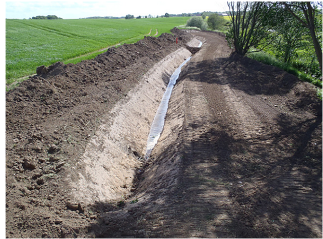
Fig. 2 – Buffer construction. 3-zone buffer under construction May 2011 on farmland near Odder, eastern Jutland, Denmark. Layout following Table 2, Fig. b: drains broken by ditch in a distance of 10 m from the stream. Buffer structure side of ditch approximately 30 cm lower than field side to avoid ponding.

The described three-zone buffer systems are very versatile and can be adapted to fit into most farm settings and will have a positive effect on surface water quality even though the exact catchment wide effect is difficult to predict. However, although promising, what is still needed to inform policy-making is a thorough cost–benefit analysis of farm scale and landscape scale buffer implementation. Most important in this respect is data on possible yields of different suitable species in a buffer implementation along with research into optimization of buffer harvesting operations. Towards this aim, a research site of 0.2 ha was established in May 2011 on a farm in eastern Jutland using the buffer design defined in Table 2, Fig. b and Fig. 2. Species used are reed canary grass ( P. arundinacea L.), grey alder ( A. incana L.) for SRF and black alder ( A. glutinosa L.) for stream bank protection in the undisturbed