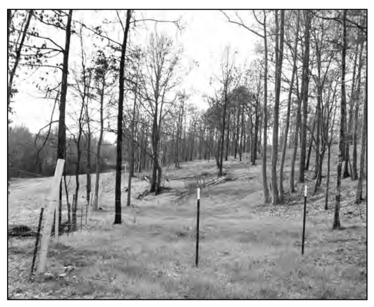
Newly developed goat silvopasture stands on the Quiet Oak Farm.