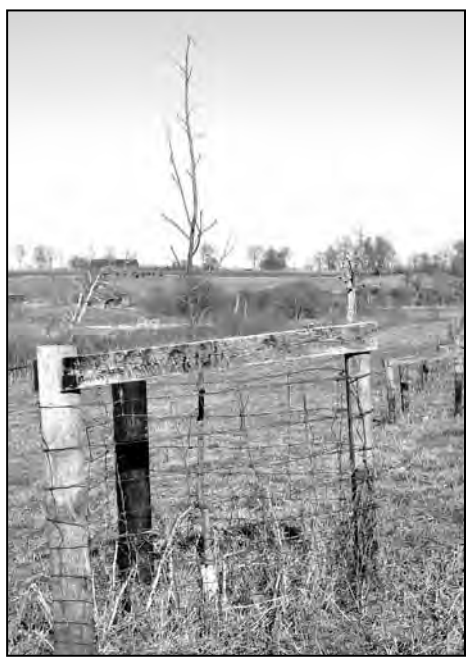
Fencing of salvaged posts and wire protects grafted hickory trees from livestock and wildlife on the Hines farm.

"For growers north of the traditional pecan belt, the Northern Nut Growers Association is a great source of information, and this group maintains an informative website," he said. "University extension programs also are excellent sources of in-