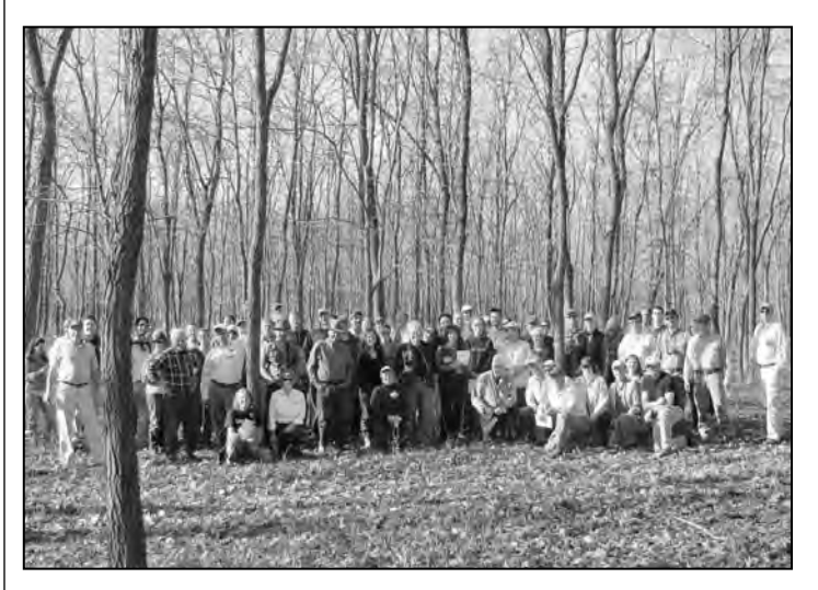
Attendees to the 2011 Northeast Silvopasture Conference pose for a picture during a field tour of the Angus Glen Farms.

first-hand, the Chedzoys' 20 years of silvopasture on the ground and overhead. During the visit, Brett shared a wealth of practical knowledge on integrating cattle and goats into the woodlots or woods into pastures on their 250 acres of owned and leased land.