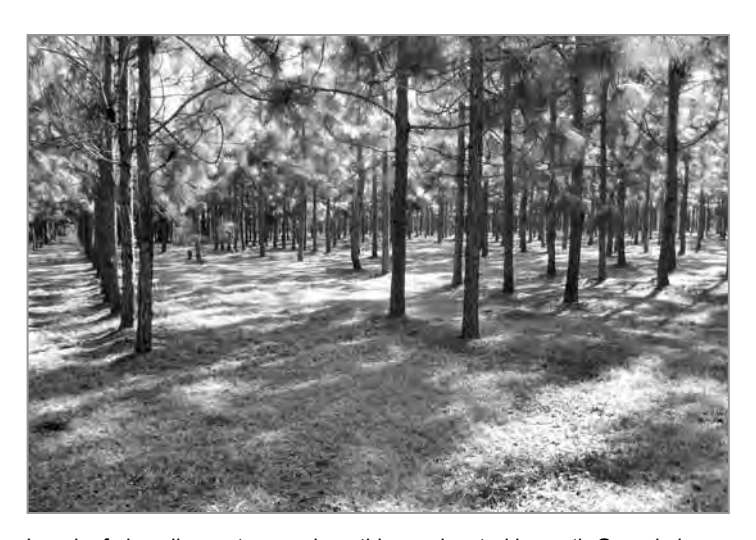
Longleaf pine silvopasture such as this one located in south Georgia have the potential to produce around 100 bales of pine straw per acre per year when the trees are between the ages of 10 and 15 years old.

Seedlings were examined for first- and second-year survival. Seedling survival was variable for both loblolly and longleaf pad-