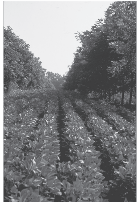
Alley cropping. University of Missouri, Center for Agroforestry.

Agroforestry practices include field, farmstead, and livestock windbreaks to protect crops, control snow, or mitigate livestock odors; riparian forest buffers along streams and rivers; silvopasture systems with trees and forage growing together for dual income; alley cropping integrating annual crops with high-value trees and shrubs; forest farming where food, medicinal, and/or decorative products are grown under the protection of a managed forest canopy; and a variety of special applications, such as riparian forest buffers that are widened to include woody plants for bioenergy production.