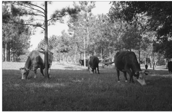
Silvopasture.

It can be intimidating coming into a training session or public meeting with very little background on the subject, especially when you don't think you know enough to even ask a relevant question. The newly released Online Silvopasture Course, www.silvopasture.org , is intended to help the user develop a basic understanding of silvopasture management. The course was developed in partnership with Alabama A&M University with assistance from the Center for Invasive Species and Ecosystem Health—Bugwood Network at the University of Georgia. The course contains seven modules and can be completed over the course of several sessions