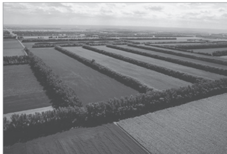
Field windbreak. Natural Resources Conservation Service file photo.

EVER wonder how to bring those great conservation ideas into reality? Think agroforestry. That's right—agroforestry. What better solution to your conservation issues than agroforestry—a unique land management approach that intentionally mixes woody plants, and crop and animal production systems to create environmental, economic and social benefits? And what better time, than now, to find funding for these practices? On June 18, 2008, Congress passed the Food, Conservation, and Energy Act of 2008 (2008 Farm Bill). In this bill are numerous opportunities for land users to get financial support for forestry and agroforestry uses through a wide range of USDA programs—some time-tested and proven, and some truly new. The federal funding programs were developed as incentives for good stewardship