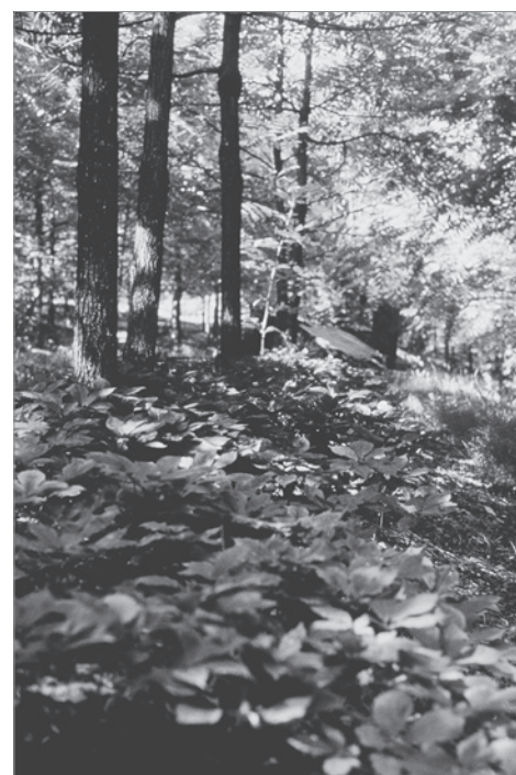
Multi-story cropping.

CRP along with its continuous signup provisions (CCRP) offers a number of opportunities to apply forestry and