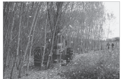
Short rotation woody crop.

Formerly known as the Conservation Security Program, CSP has been renamed and overhauled in order to be more user-