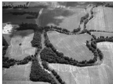
Riparian forest buffer.

Through this multi-state cooperative and working with the USDA Forest Service Northern Research Station Forest Inventory and Analysis staff (FIA), an inventory method was developed that is compatible with the national FIA system. In the first year alone an estimated 1.3 million acres of trees in windbreaks, riparian forests and buffers providing agroforestry benefits were inventoried that were previously unaccounted under existing inventory processes. Now these four states can begin to more intentionally manage their agroforestry