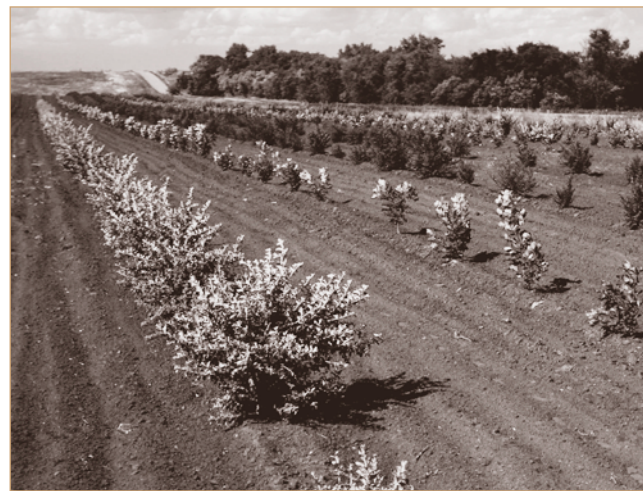
The area or strip near the road (far edge of wind-break) will be maintained mechanically as an effective firebreak reducing the likelihood of fires spreading into and through the planting.

direction during fire season is an important planning criterion for locating the agroforestry practice. Another tactic is planting fire-resistant trees in the outer rows of multi-row plantings near homes or on the edges of small communities. Here, the trees create a “three dimensional” firebreak and could even catch firebrands that typically jump ahead and downwind during