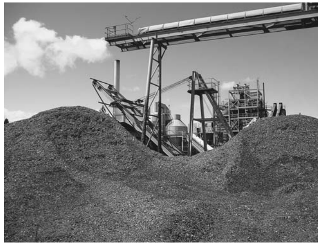
Biomass production from wood fiber removed during forest fuel reduction treatments provides alternative energy, thereby reducing fossil fuel consumption.

Responding to and managing change is the most proactive of the 5 R's approaches. This strategy assumes that a decision-maker acknowledges the inevitability of change and adopts the humility that we have limited capacity