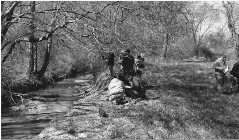
An interdisciplinary team in Maryland evaluates a stream and riparian corridor adjacent to cropland to determine health of this landscape setting. They are using the Stream Visual Assessment Protocol.

complementary herbaceous habitat absent? Are the existing woody species not producing adequate cover, habitat, and food for common and desired wildlife? Are plantings disconnected and not facilitating movement of wildlife on and through the site?