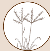
Big Bluestem Plant