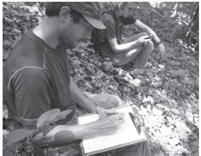
📍 Rural Action staff collect data.