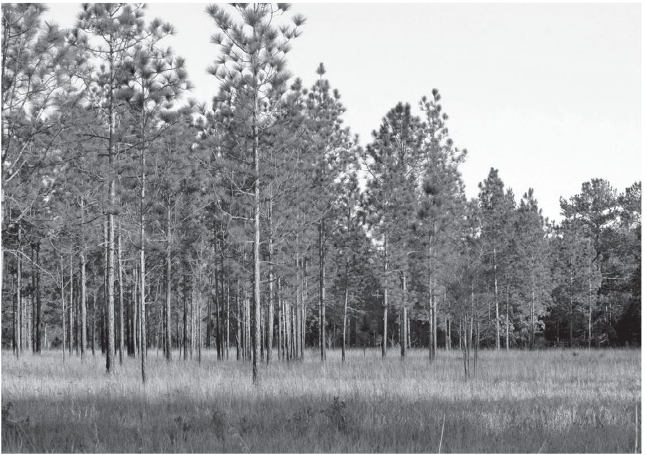
⤴ Daigle's longleaf pine ecosystem with herbaceous understory managed with fire and herbivory in Beauregard Parish, Louisiana.

If the proposal is given final approval, the Kisatchie National Forest would provide grazing allotments to allow targeted grazing to enhance and restore longleaf pine ecosystems. Cattle provided by Daigle would act as “mowing machines” for management of red-cockaded woodpecker, northern bobwhite quail, and the native vegetative communities, as opposed to hiring mechanical mowing contractors and implementing unnatural fire frequencies to deal with native and exotic vegetation invasion.