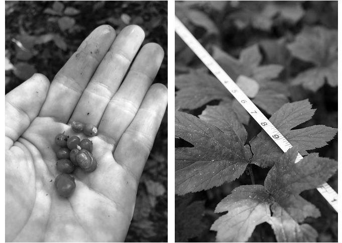
⬆ Ginseng berries.

It is through this lens that Rural Action and the Wayne National Forest developed a partnership to help support the sustainable management of American ginseng on the national forest through the establishment of long-term research and monitoring plots. This research is one of the few long-term data collection projects that have been conducted for this species, and it has helped forest managers to establish appropriate harvest regulations and make better informed management