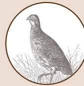
Northern Bobwhite Quail