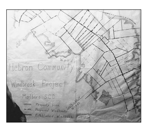
This map, circa 1967, details the Hebron Community-wide windbreak plan. Approximately 55 landowners set pine windbreaks to protect 3500 acres.

Clouds of dust and blowing soil are usually associated with the Great Plains Dust Bowl of the 1930's and not the coastal plain of South Carolina. However, the mid-1960's saw significant dust storms on the sandy soils in Marlboro County in northeastern South Carolina. "In the past, this area was considered a garden spot with above average land values and cotton growers who won production contests. But, homeowners started complaining about the 'dust and grit' in their houses and damage to their paint from sandblasting," according to 'Bunny'