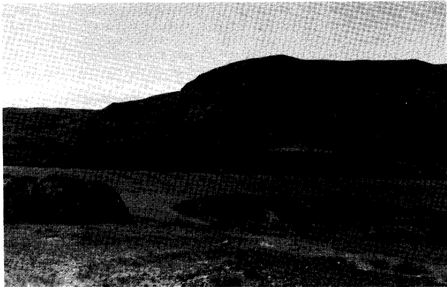
An orchard near Mattawa, Washington with single row poplar windbreak spaced at approximately 660 feet. Picture taken looking across the Columbia Basin.

The Columbia Basin is very young as far as the orchard industry is concerned. Fifty to 60 percent of the orchards aren't even mature yet, which is why Crose's role is so important. When establishing a new orchard, a windbreak is as much a part of the layout plan as the orchard trees