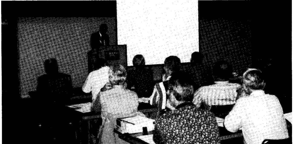
Over 130 natural resource professionals attended Agroforestry and Sustainable Systems , the first Symposium hosted jointly by the Agroforestry Center and the USDA Soil Conservation Service. Based on positive feedback and enthusiasm about agroforestry, the future looks bright for another Symposium in the next couple of years.