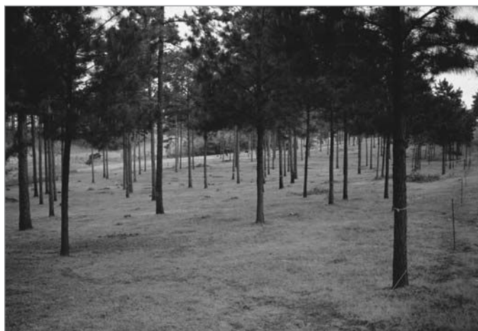
Young trees in this silvopasture have been pruned to improve future wood quality and to allow sun light to reach the ground for adequate forage production.

The relative portion of the tree height with branches, or live crown, affects the decision to prune in two ways. The first relates to the health and vigor of the tree and the second relates to the structural integrity of the tree and quality of its wood. Branches support the largest proportion of the energy-producing part of the tree, the needles or leaves. Removing too many branches removes leaves, weakening the tree, reducing growth, and making it more susceptible to insect and disease attack. During a single pruning operation, remove no more than one-third to one-half of the total crown. Branches on a tree trunk influence the form and development of the trunk. Trees with less than one-third live crown have poorer wood quality and develop weaker stems. Therefore, maintain a live crown of no less than one-third of the tree height.