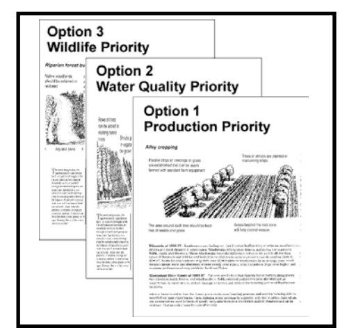
Develop and discuss options with the landowner.

Formulating a viable option typically requires repeated design, evaluation, and refinement. A