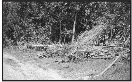
Properly planned, waterbreaks can effectively trap flood debris.