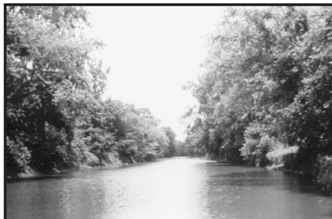
Trees along this streambank will effectively control bank and surface erosion.

In addition, complex ownership patterns may require group planning for proper waterbreak design, function, use, and management.