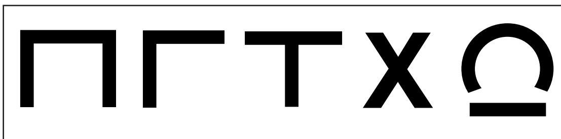
Figure 1 — Various design configurations of outdoor living barns.

Shape: typically in the form of a “U” or upside down “L” as shown in Figure 1.