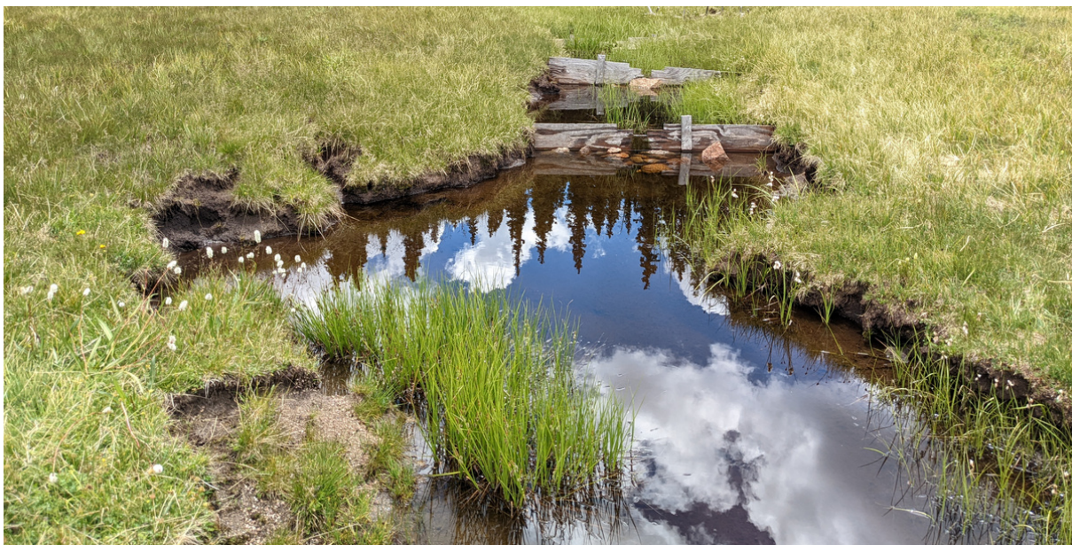
Grasshopper Creek Fen, 2022