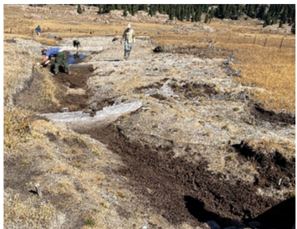
2020 Annual ongoing monitoring and maintenance was important for success