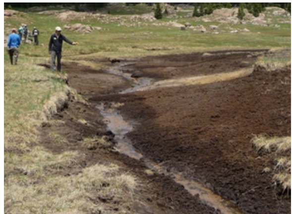
2017 Active erosion and sedimentation into Grasshopper Creek prior to restoration efforts