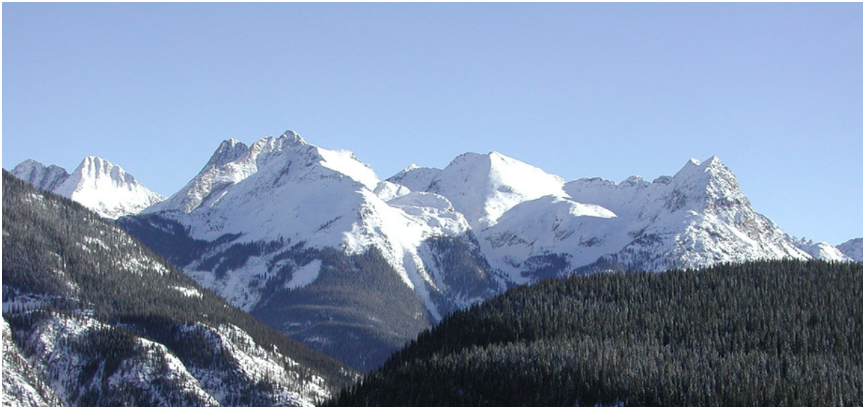
Winter has arrived in Southwest Colorado