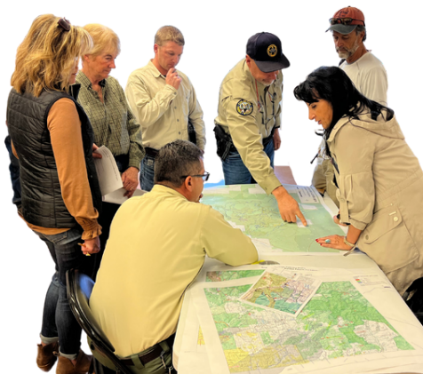
Jackson Mountain Project Open House brought together diverse stakeholders to weigh in on project development.

In SW Colorado, we face increasing threats to our forests and watersheds—from wildfires to climate change and beetle kill. RMRI and CFLRP represent a better coordinated and collaborative approach to protecting our values, including our water, forests, communities and recreation. To produce meaningful results on the ground, we need to manage Colorado landscapes at a much larger scale. How? Through focused funding as well as better coordination and collaboration by all those affected, including people like you! These landscape-scale initiatives bring together national, regional, state, Tribal and local players to plan, prioritize, and act.