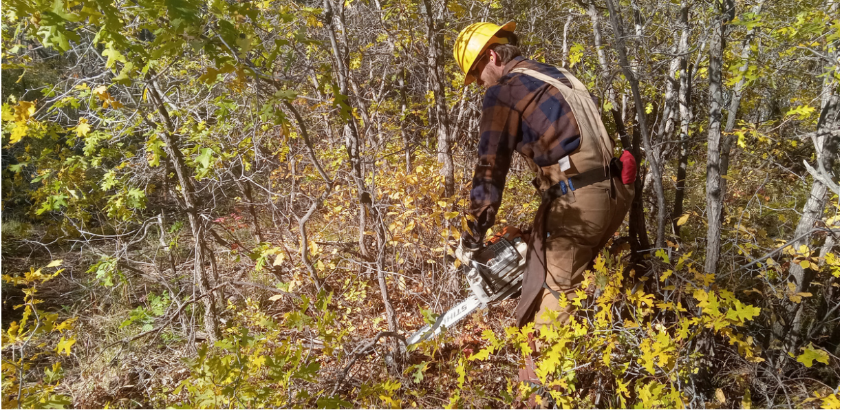
SCC crew member clearing gambel oak