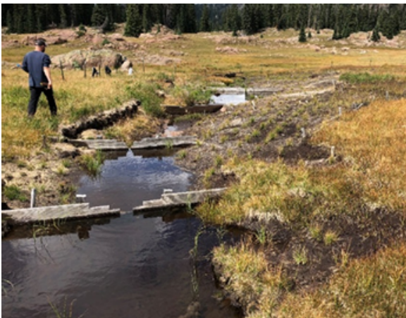
Check dams are slowly restoring groundwater hydrology and allowing vegetation to reestablish (2021)

wilderness site by horseback and installing materials for excluding and monitoring impacts from wildlife and grazing.