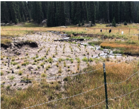
Overview of Grasshopper Creek Fen after restoration efforts (2021)