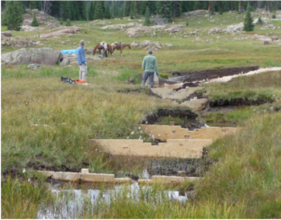
Multiple resource programs were involved to get materials and supplies to the restoration site (2020)