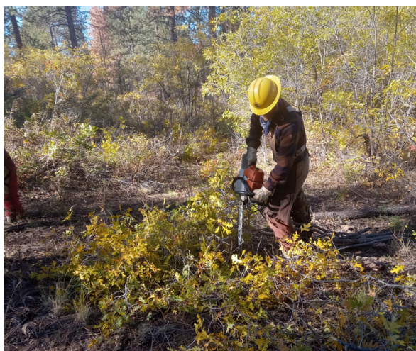
SCC crewmember de-limbing