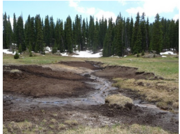
Overview of Grasshopper Creek Fen prior to restoration efforts in 2017.

This project has been a team effort. The Columbine Range and Wildlife Programs were instrumental in delivering the restoration supplies and materials to the