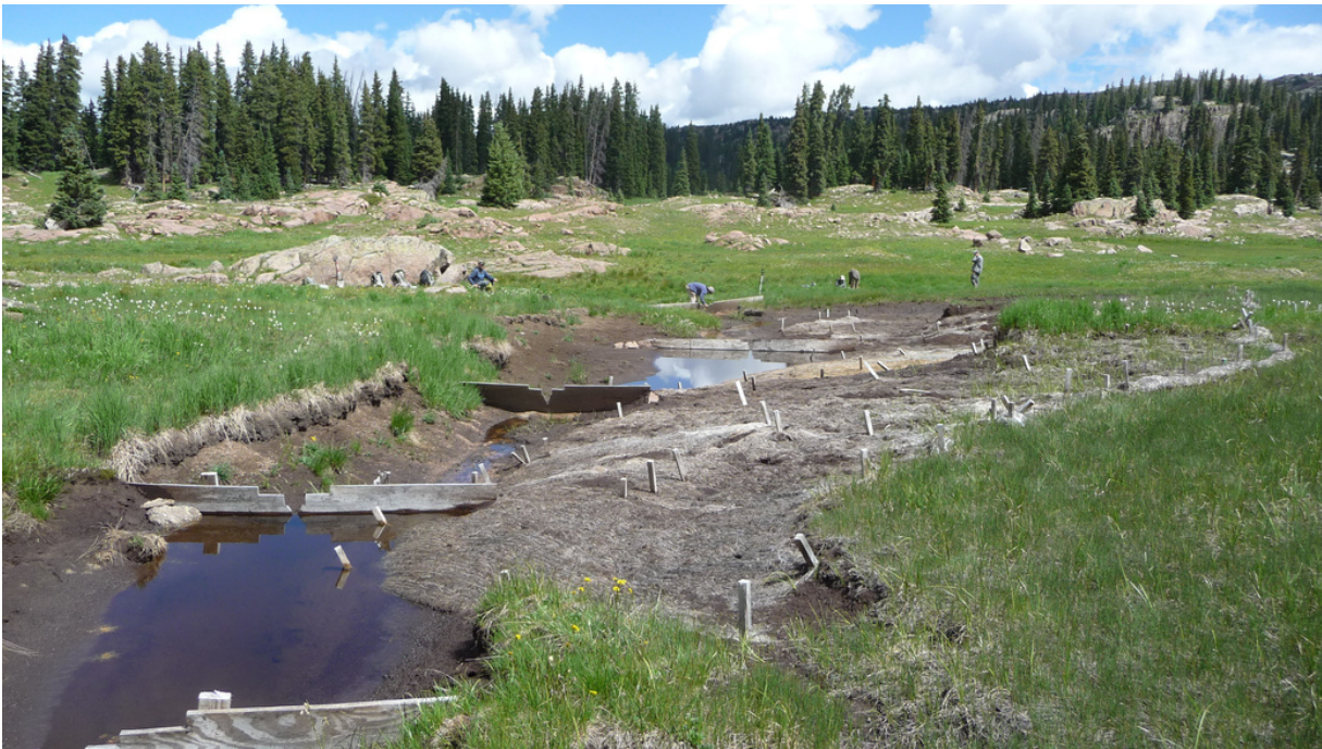
Crew working on restoration efforts in 2019