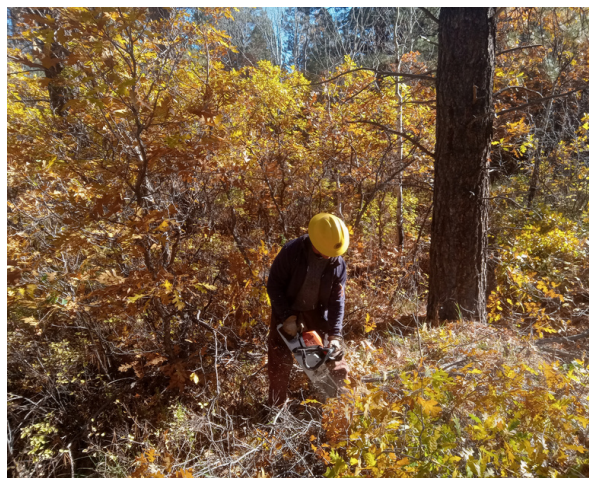
SCC crewmember de-limbing