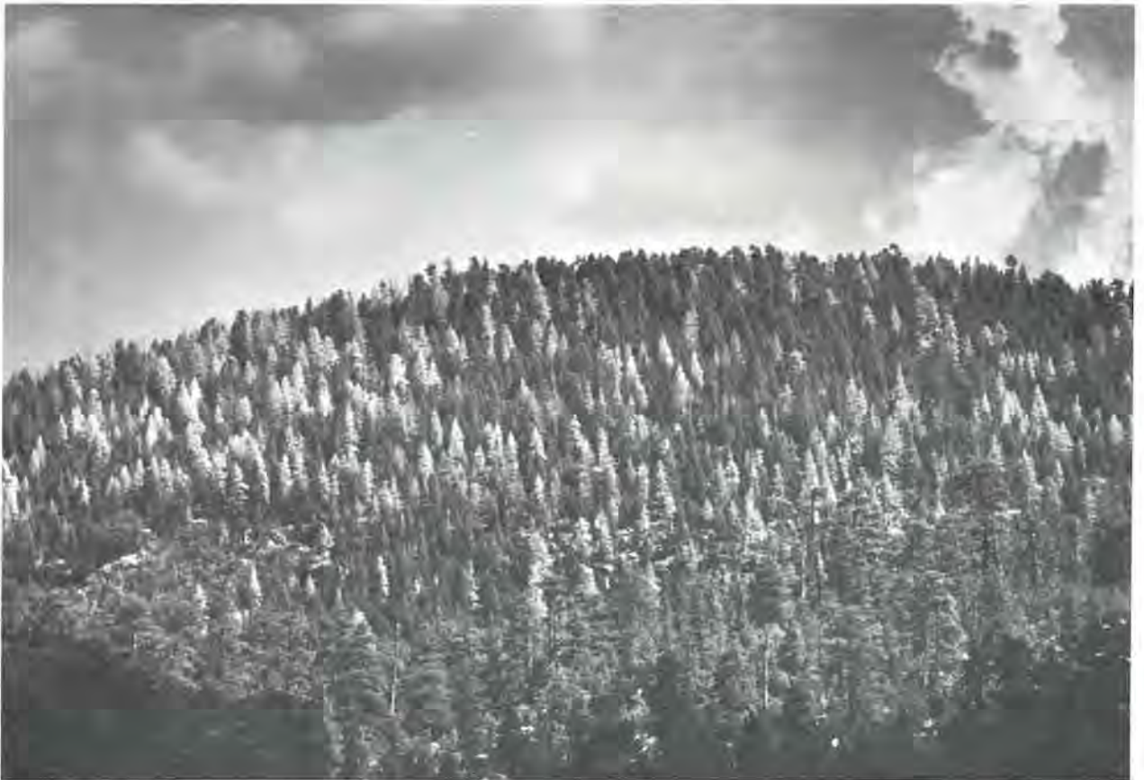
Severe killing of Douglas-fir by the Douglas-fir beetle. Bill Williams Mountain, Kaibab National Forest, Ariz.

Grass plant bug , Labops hesperius Uhler. About 1,200 acres of severely infested crested wheatgrass at Cuba, N. Mex., were sprayed to control this plant bug. This represents about 15 percent of the total infested area. Malathion was applied by helicopter. Control results were excellent.