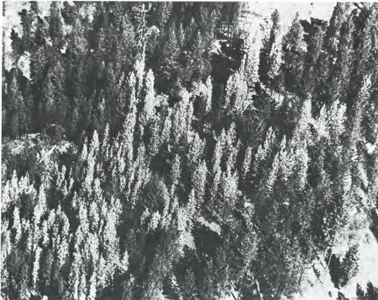
Group killing of ponderosa pine by Oregon pine ips. Nezperce National Forest, Idaho.

Douglas-fir tussock moth, Hemerocampa pseudotsugata McD. A major epidemic developed, and about 190,000 acres were infested between Troy and Plummer, Idaho. Grand fir and Douglas-fir trees were 70 to 90 percent defoliated within several thousand acres. Dam-