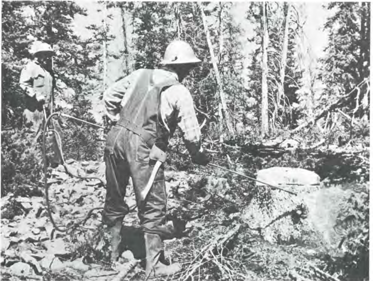
Engelmann spruce stump sprayed for control of Engelmann spruce beetle. Uinta National Forest, Utah.

Engelmann spruce beetle, Dendroctonus obesus (Mann.). ( D. engelmanni Hopk.). With two exceptions the Engelmann spruce stands of the Intermountain States are nearly free of bark beetle activity. One exception is an area on the Dixie National Forest, Utah, where there was a general increase in infestations. The bark beetles in this area moved