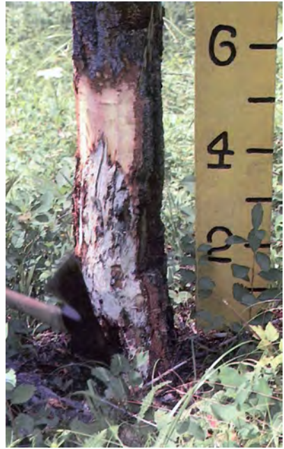
Figure 4 —Removing the bark at the base of the symptomatic ponderosa pine in figure 3 reveals the characteristic mycelial fans.

Because these fungi commonly inhabit roots, their detection is difficult unless characteristic mushrooms are produced around the base of the tree or symptoms become ob-