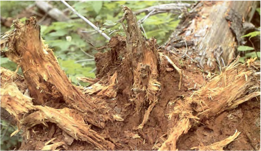
Figure 9 – Wood of Douglas-fir in advanced stages of decay is light yellow and stringy.