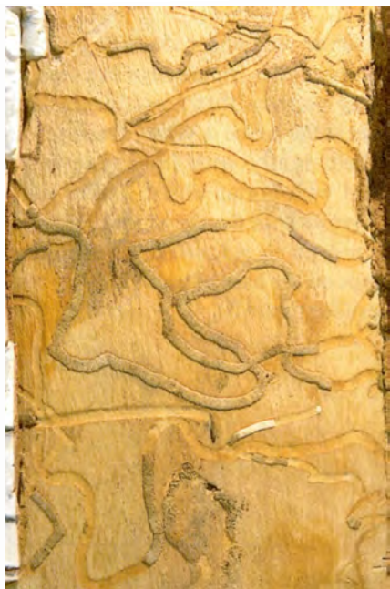
Figure 5. Meandering or zigzag galleries formed under the bark by tunneling larvae.