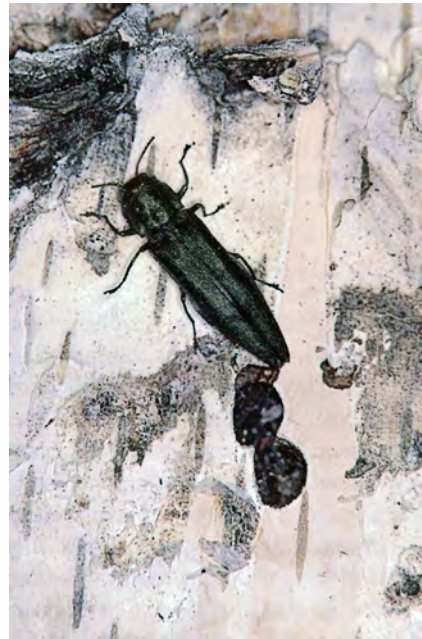
Figure 1. Bronze birch borer adult and two D-shaped exit holes.

Bronze birch borers are known to attack all native and introduced birch species, although birch susceptibility varies. Many varieties of birch species as well as numerous crosses between species are currently planted as ornamentals in North America. Although some varieties are more resistant than others, none are im-