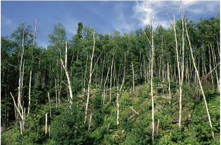
Figure 8. Paper birch killed after a severe regional drought in northern Minnesota.

Bronze birch borers infested and ultimately killed many of these trees (figure 8). Massive birch mortality was observed throughout the Great Lakes region in the early 1990’s indicating that many of the existing birch-dominated ecosystems throughout the region were aging and more likely to be stressed by weather events. Developing a mosaic of age classes should reduce bronze birch borer impact over a large area and contribute to the stability of the birch resource within that region.