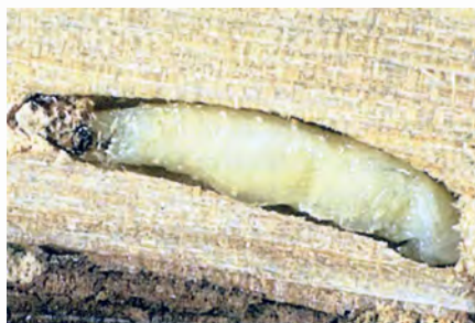
Figure 7. Pupa of the bronze birch borer.