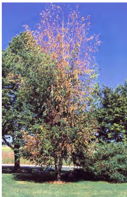
Figure 2. A landscape birch tree infested with bronze birch borers. Branches in the upper canopy are usually affected first.

The condition of host trees is the principal factor in the birch tree and borer relationship. Adult bronze birch borers primarily attack birches that are weakened or stressed by drought, old age, insect defoliation, soil compaction, or a stem or root injury. Birch trees prefer cool, moist growing locations and have a shallow root system that is easily injured by disturbance or dry, hot conditions. Many landscape birch trees are planted in unsuitable habitats and are stressed on a regular basis. Birch trees growing within a forest are stressed by old age, weather events such as drought, or by repeated defoliation. Widespread birch mortality often occurs after these events.