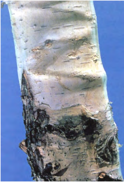
Figure 3. Swellings or bumps formed where a tree has healed over a gallery of the bronze birch borer.