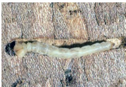
Figure 6. Larva of the bronze birch borer.

Adults emerge from previously infested trees between early May and early June in the southern part of the borer's range and from late June to mid-July further north. Adults in any one location may emerge over a 5- to 6-week period. Adult beetles live about 3 weeks. Therefore, adults may be found on trees during most of the summer.