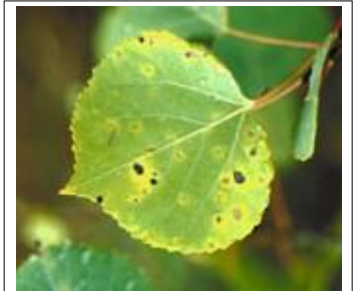
Figure 6. Symptoms of aspen leaf spot.

Aspen leaf spot is the most common leaf disease of aspen in the West. Severe outbreaks may cause foliar browning in midsummer and nearly complete defoliation by early August. Regrowth usually follows in late summer and early autumn. Symptoms include small brownish spots on infected leaves in mid- to late-summer. The spots later enlarge and turn black in color. They will vary in size and appear irregular in shape with a yellowish border (Figure 6). Blight and leaf spot caused by this disease have been seen in the past throughout the host type, and although not indicated on ADS maps, it is likely a contributing factor to aspen decline.