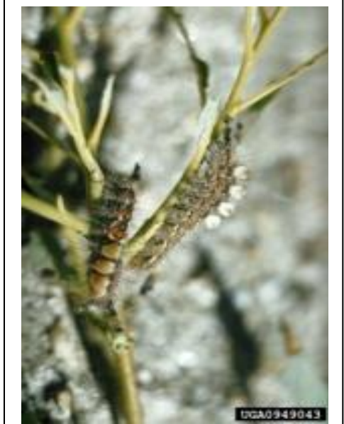
Figure 2. Douglas-fir tussock moth larvae.

The forest tent caterpillar is the most widely distributed and destructive tent caterpillar in North America. Aspen is the preferred host, but it will attack a wide range of deciduous trees and shrubs. Larvae do not build tents, instead they create a silken mat on leaves, branches, or trunks where they