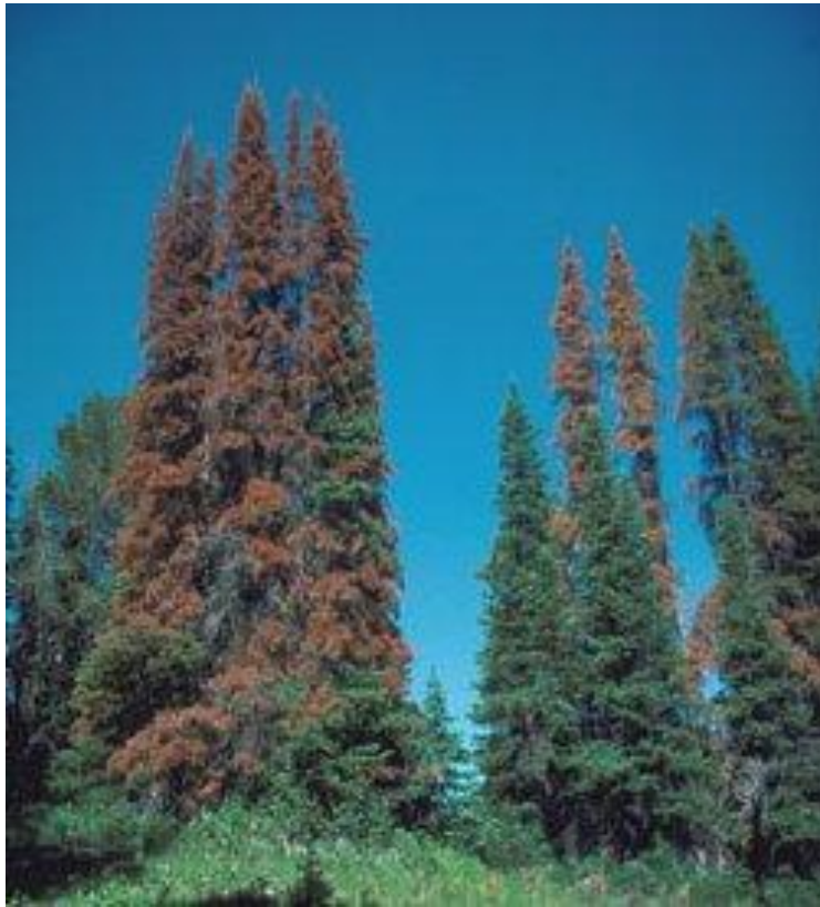
Figure 7. Subalpine fir mortality.