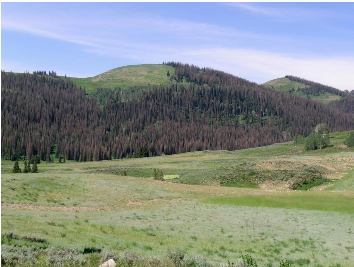
Figure 3. Spruce mortality on Price Ranger District, Manti-LaSal National Forest.

In 2010, spruce mortality attributed to this insect occurred in Sevier, Summit, Wasatch, and Utah counties and increased more than 50% since 2009. However, during the same period, tree mortality in Garfield county decreased by nearly 90%. The spruce beetle outbreak still poses important management concerns for the heavily used recreation areas along the Wasatch Front.