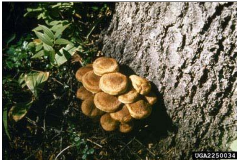
Figure 5. Armillaria fruiting bodies

Evidence of Armillaria root disease can be found throughout the state. It often functions as a weak parasite killing trees experiencing environmental stress. In southern Utah, it may act as a primary pathogen killing mature and immature ponderosa pine and mature fir and spruce on cool sites at higher elevations. It often acts as a thinning agent in young stands or in areas with shallow, poor soils. Symptoms of Armillaria include heavy resinosis at the root collar, and thick, fan-shaped mats of white fungus tissue under the bark where root and root collar tissue are dying. The fungus produces rhizomorphs that resemble black string like structures that can move through the soil a few feet to infect other roots. When present, mushroom-type fruiting bodies grow in clusters from the roots or at the base of the tree (Figure 5). The decay caused by the fungus is yellowish and stringy/spongy and often contains black lines called zone lines.