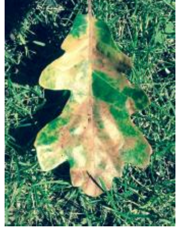
Bur oak leaf with symptoms of bur oak blight.

The drought is also taking its toll on limber pines and white spruce, it has become a hotter, drier site.