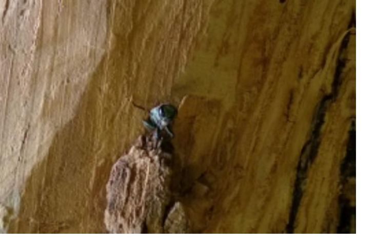
EAB emerging from an ash log. (Brian Garbisch, 2014, Boulder, CO)