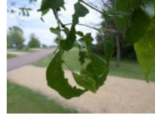
May beetle defoliation on ash in an eastern SD campground (Dr. Ball, Pest Update June 8, 2016, Vol. 14, No. 18.

Honeylocust borer ( Agrilus difficilis ) is a close relative to the emerald ash borer. It is native to the United States and is only known found in honeylocust. The insect is not a common pest but we do see it in young, stressed honeylocust across the state. There are samples of this insect in the SDSU insect museum caught in Kadoka back in 1920. The borer destroys drought-stressed trees by girdling the phloem tissue.