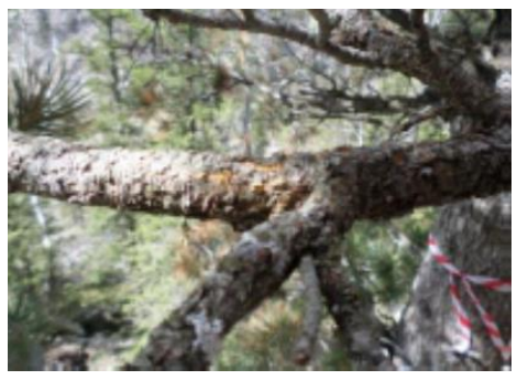
White pine blister rust on limber pine in Custer State Park.