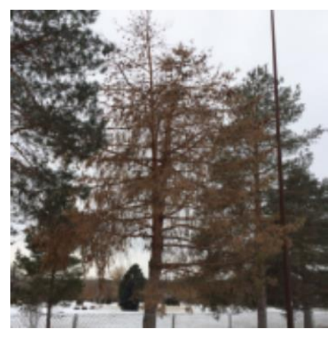
Scotch pine in Rapid City, SD suspected of pine wilt mortality. (Marcus Warnke 2016).