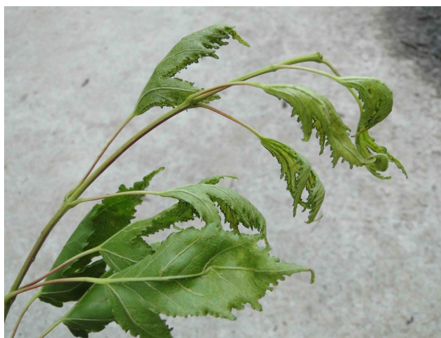
Distorted leaves of maple typical of plant growth regulator herbicides such as 2,4-D or dicamba