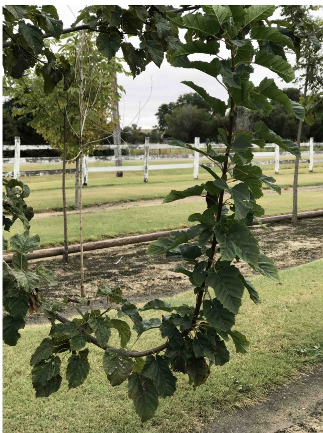
Distorted branch formation in nursery tree affected by herbicide, making tree unsalable

Damage to trees from herbicides was widespread and sometimes severe in 2017. Nursery trees in some cases were so severely damaged as to be a total loss. Certain herbicides, such as 2,4-D and dicamba, that are commonly used in agricultural fields and in urban landscapes often drift or volatilize and damage trees nearby. The use of dicamba on dicamba-tolerant soybeans is becoming a serious threat to trees near areas where it is applied.