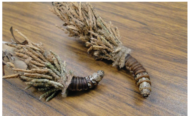
Bagworm larvae with their bags