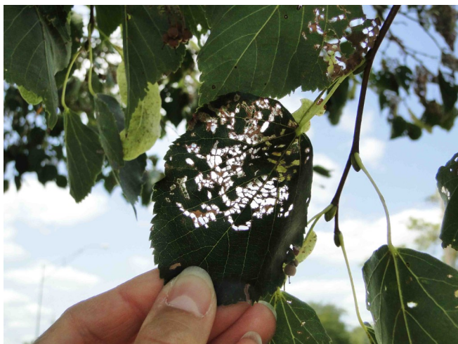
Leaf feeding damage on linden by Japanese beetle