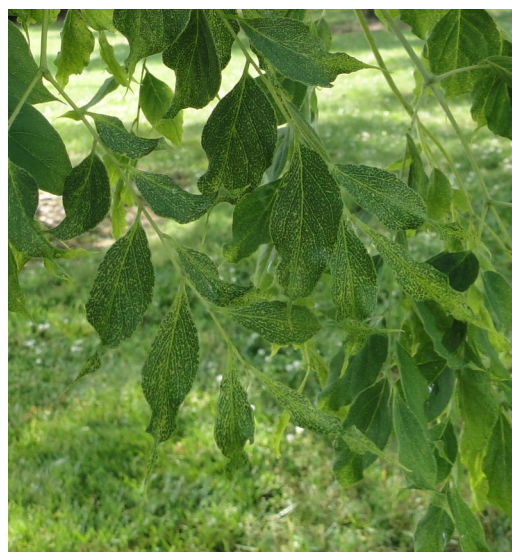
Herbicide induced distortion and discoloration of Kentucky coffeetree leaves