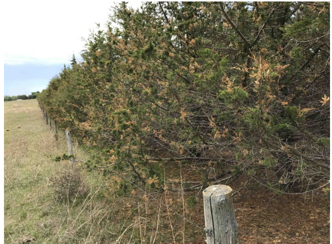
Flagging in eastern redcedar windbreak attributed to cedar bark beetle

Mountain pine beetle populations in western Nebraska seem to have returned to the low levels that existed prior to the 2009 outbreak.