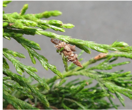
Young bagworm caterpillar on Juniperus species

Bagworm continued to be a problem in 2017, particularly in south central and south eastern areas of the state. Bagworm is commonly found in windbreaks on spruce, juniper and eastern redcedar, but also attacks a number of broadleaf trees.