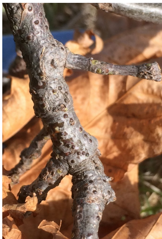
Golden oak scale

Golden oak scale was reported on oaks in central Nebraska in 2017. This pit-making scale is easily overlooked and is not often reported. Scales commonly found in Nebraska include oystershell, scurfy, pine needle, and kermes scale.