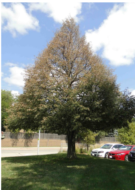
Linden defoliated by Japanese beetle

Japanese beetle populations were very high in many locations in 2017. Linden trees were frequently reported to be severely defoliated. Other severely affected tree and shrub hosts included cherry, peach, birch, and hazelnut. The Nebraska Department of Agriculture lists 30 counties as infested in 2016.