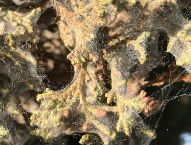
Rocky Mountain juniper with extensive webbing caused by spider mites

Spider mites were a problem in 2017, affecting both broadleaf and conifer trees, especially in western Nebraska. Affected foliage showed yellowing and browning and often was covered with extensive webbing. Two-spotted spider mite appeared to be responsible in many cases.