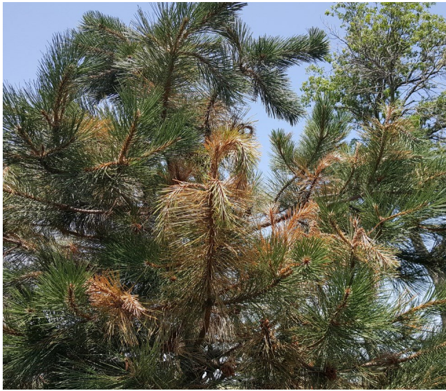
Curled pine branches and dead foliage probably caused by 2,4-D or dicamba applied nearby