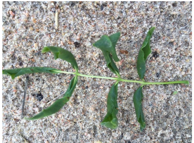
Ash leaf with cupped leaflets probably caused by 2,4-D or dicamba applied nearby

Damage to trees from herbicides applied around or upwind from the trees was widespread and sometimes severe in 2016 and appeared to be more common than in previous years. Certain herbicides, such as 2,4-D and dicamba, that are commonly used in agricultural fields often volatilize and damage trees nearby. The use of dicamba on dicamba-tolerant soybeans is becoming a serious threat to trees near areas where it is applied.