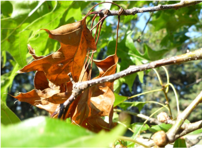
Tip dieback from Botryosphaeria quercuum on pin oak

Tip dieback caused by the canker-causing fungus Botryosphaeria quercuum was common in red oaks in central and western Nebraska.