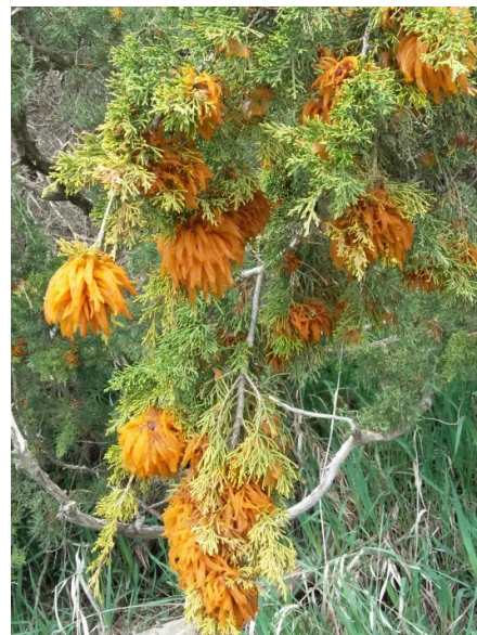
Orange spore masses from gymnosporangium rust galls on juniper

Above average rainfall in the spring and early summer in eastern Nebraska led to a much greater occurrence of foliar diseases that are more common in wet years, such as gymnosporangium rusts (cedar-apple rust on crabapples and cedar-hawthorn rust on hawthorn and pear), anthracnose on sycamore and maple, powdery mildew on oak, and oak leaf blister. Foliar symptoms were common, but no significant damage was seen.