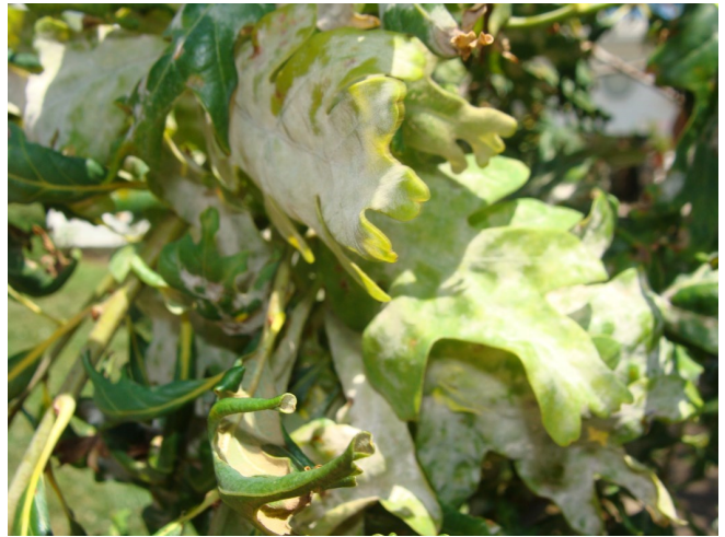
Powdery mildew on oak