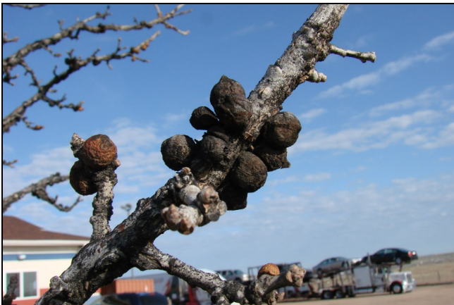
Rough bullet galls on bur oak

Rough bullet gall continues to be a serious problem on bur oaks in western Nebraska. Abundant galls cause severe stunting of growth, and the honeydew produced by the galls attracts large numbers of nuisance wasps. Some bur oaks are highly susceptible to the gall while others are highly resistant.