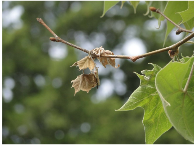
Leaf blight and twig dieback from anthracnose on sycamore