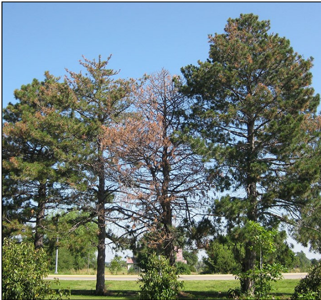
Austrian pines in decline from Diplodia blight

Diplodia blight continued to kill and damage many pines in Nebraska in 2016 in both urban and rural landscapes, but damage was less common than in previous years, probably because of reduced drought stress resulting from three years of near normal precipitation. Mortality and damage was most common on Austrian and ponderosa pines.