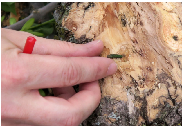
The first EAB specimen found in Nebraska