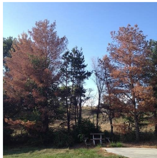
Scotch pines killed by pine wilt

Pine wilt continued to kill thousands of Scotch and Austrian pines in eastern and south-central Nebraska in 2016. The disease also occurred in scattered locations in the central, southwestern and western parts of the state. Because of pine wilt, the Nebraska Forest Service no longer recommends using Scotch pine in long-term plantings.