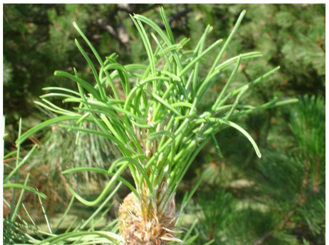
Curled pine needles probably caused by 2,4-D or dicamba applied nearby