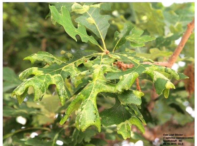
Oak leaf blister