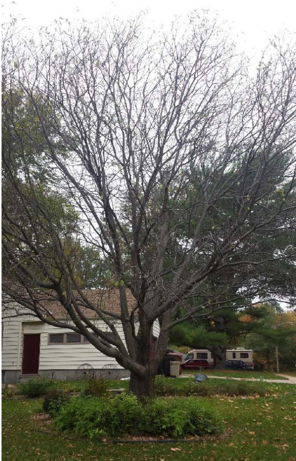
Extensive defoliation from apple scab on crabapple