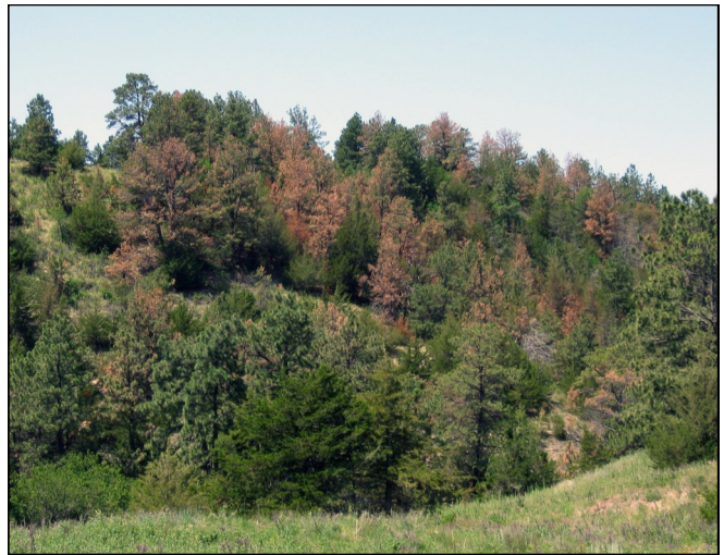
Ponderosa pines along the Snake River in Nebraska damaged and killed by Ips beetles

Ips beetles continued to cause damage in native ponderosa pine in western and north-central Nebraska, but caused less damage than in previous years. The reduced damage was most likely because of reduced drought stress resulting from three years of near normal precipitation and because of better handling of slash piles after logging operations. Ips beetles continued to cause mortality within and adjacent to areas recently affected by wildfires.