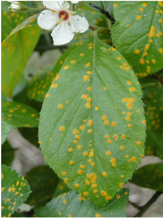
Leaf spots from a rust disease on hawthorn