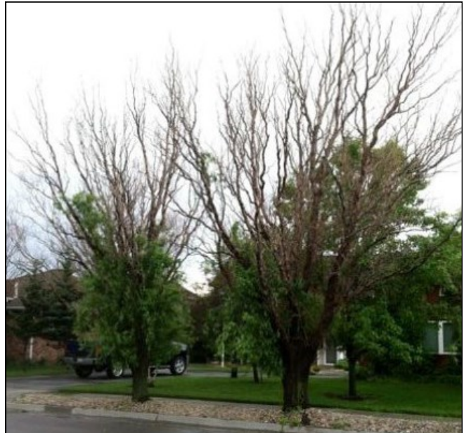
Willows declining from cankers and environmental stresses

Several locations in eastern Nebraska experienced a decline in willows in 2015. This was probably caused by stress from the recent years of drought, injury from fluctuating temperatures in the late fall of last year and early spring of this year and canker diseases that are common on willow.