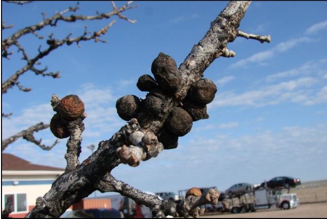
Rough bullet galls on bur oak

Rough bullet gall has become a serious problem on bur oaks in western Nebraska. Abundant galls cause severe stunting of growth, and the honeydew produced by the galls attracts large numbers of nuisance wasps. Some bur oaks are highly susceptible to the gall while others are highly resistant.