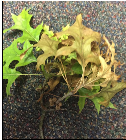
Tip dieback from Botryosphaeria quercuum on pin oak

Tip dieback caused by the canker-causing fungus Botryosphaeria quercuum was common in red oaks in central and western Nebraska.