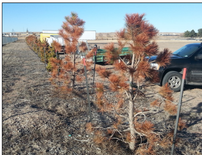
Ponderosa and Austrian pines in western Nebraska injured by warm fall temperatures that rapidly dropped to below freezing

Very warm early fall temperatures in 2014 followed by a rapid drop to below freezing caused freeze injury that appeared in 2015 on many pines in western Nebraska.