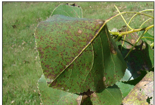
Septoria leaf spot on cottonwood

Rainfall across the state was higher in 2015 than in many of the previous this year, which led to greater problems with foliar diseases on many hardwoods. Marssonina leaf spot and Septoria leaf spot were two very common diseases on Populus species.