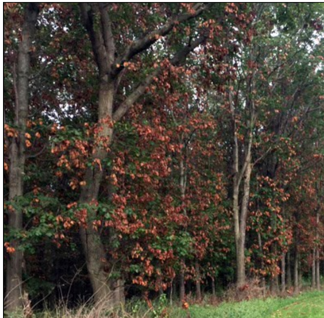
Extensive twig dieback from cicada injury and an unidentified canker