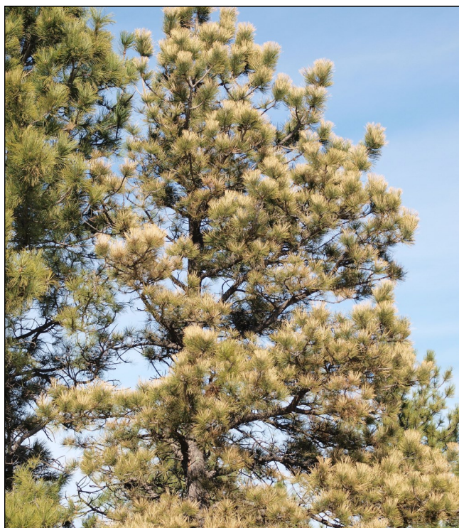
Ponderosa pine in western Nebraska injured by warm, windy conditions during late fall

Pines in far western Nebraska showed substantial needle browning in January 2015 apparently from short-term severe drought stress that began in the fall of 2014. The needle browning seemed to be caused by warm and windy conditions in November and December after the ground had frozen.