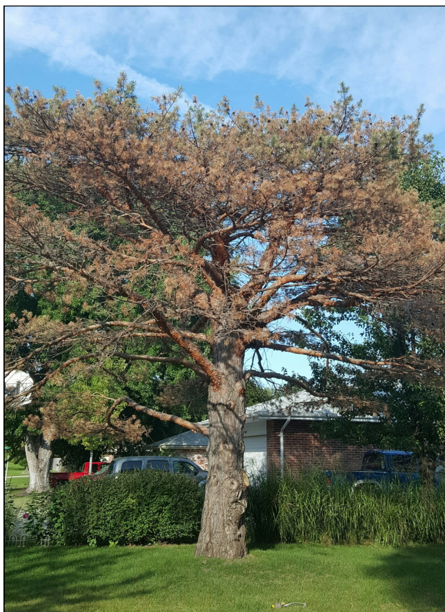
Scotch pine killed by pine wilt

Pine wilt continued to kill thousands of Scotch and Austrian pines in eastern and south-central Nebraska in 2015. The disease also occurred in scattered locations in the central and southwestern parts of the state. Because of pine wilt, the Nebraska Forest Service no longer recommends using Scotch pine in long-term plantings.