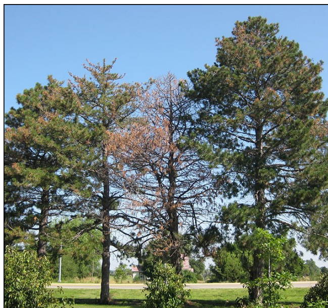
Austrian pines in decline from Diplodia blight

Diplodia blight continued to kill and damage many pines in Nebraska in 2015 in both urban and rural landscapes. Mortality and damage was most common on Austrian and ponderosa pines.