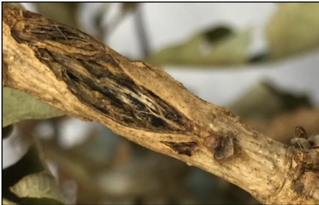
Cicada injury on an oak twig

Oaks, hackberries and other hardwoods in many areas of Nebraska were heavily damaged in 2015 by the 17-year cicada. Twig dieback was extensive in some locations. The dieback occurred because of the injury caused by the female cicada when she lays eggs in twigs.