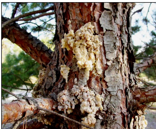
Large masses of pitch from attacks by Zimmerman pine moths

Three species of Zimmerman pine moth ( Dioryctria spp.) continued to cause branch and tree mortality in Nebraska. Symptoms include masses of pitch (resin) that form on the bark where the insects are tunneling inside. The insects are present throughout western and central Nebraska and in the Lincoln and Omaha areas in the east. Ponderosa, Austrian and Scotch pines are commonly attacked, and young trees generally sustain more damage than mature trees.