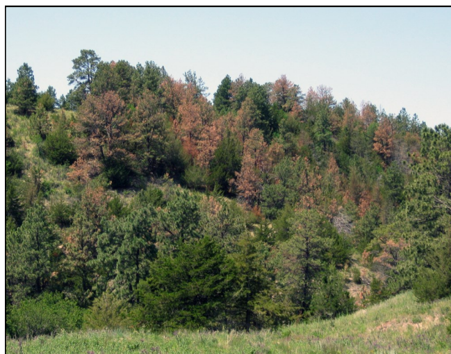
Ponderosa pines along the Snake River in Nebraska damaged and killed by Ips beetles

Ips beetles continued to cause damage in native ponderosa pine in western and north-central Nebraska, but caused less mortality and damage than in 2014 and 2013. The reduced damage was most likely because of reduced drought stress resulting from near normal precipitation in 2014 and 2015 and because of better handling of slash piles after logging operations. Ips beetles also continued to cause mortality within and adjacent to areas recently affected by wildfires.