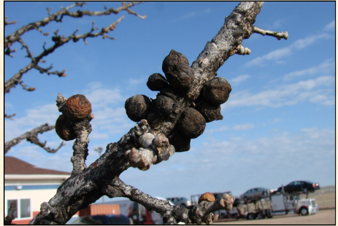
Rough bullet galls on bur oak.

Rough bullet gall has become a serious problem on bur oaks in western Nebraska. Abundant galls cause severe stunting of growth, and the honeydew produced by the galls attracts large numbers of nuisance wasps. Some bur oaks are highly susceptible to the gall while others are highly resistant.