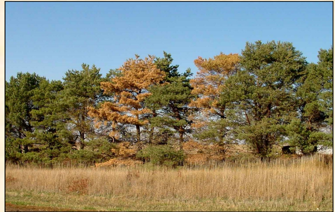
Scotch pine windbreak and trees killed by pine wilt.

Pine wilt continued to kill thousands of Scotch and Austrian pines in eastern and south-central Nebraska in 2014. The disease also occurred in scattered locations in the central and southwestern parts of the state. Because of pine wilt, the Nebraska Forest Service no longer recommends using Scotch pine in long-term plantings.