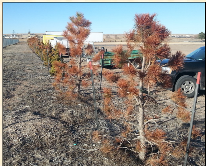
Ponderosa and Austrian pine in western Nebraska injured by warm temperatures that rapidly dropped to below freezing.

Very warm early fall temperatures followed by a rapid drop to below freezing caused freeze injury on many pines in western Nebraska.