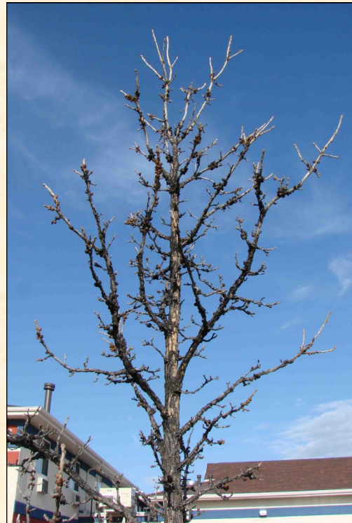
Bur oak stunted by heavy infestation of rough bullet gall.