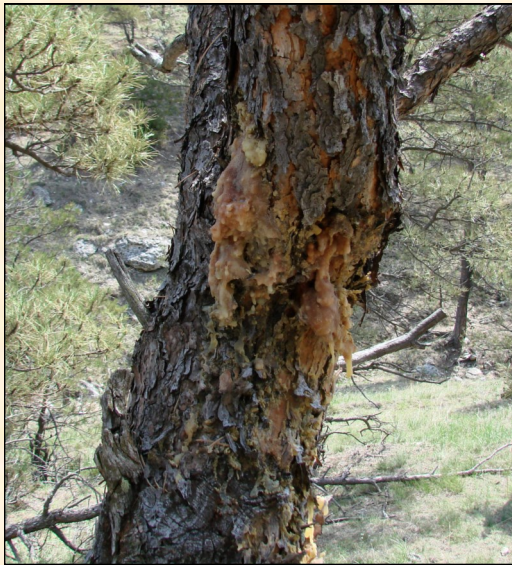
Large masses of resin indicate attack by Dioryctria species.

Three species of Zimmerman pine moth ( Dioryctria spp.) continued to cause branch and tree mortality in Nebraska. Symptoms include masses of pitch (resin) that form on the bark where the insects are tunneling inside. The insects are present throughout western and central Nebraska and in the Lincoln and Omaha areas in the east. Ponderosa, Austrian and Scotch pines are commonly attacked, and young trees generally sustain more damage than mature trees.