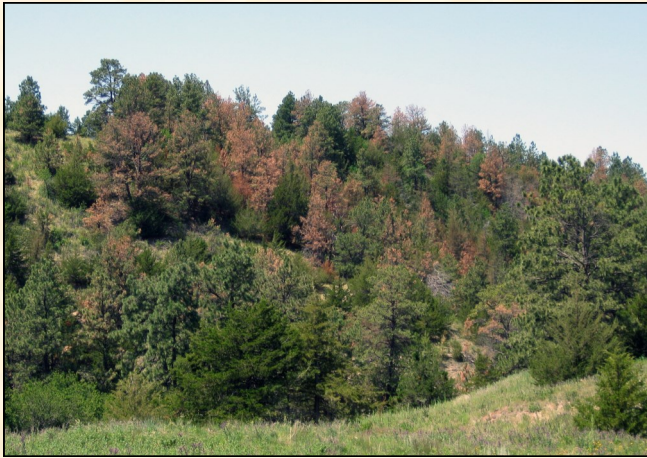
Ponderosa pines along the Snake River in Nebraska damaged and killed by Ips beetles.

Ips beetles continued to cause damage in native ponderosa pine in western and north-central Nebraska, but caused less mortality and damage in 2014 than in 2013. The reduced damage was most likely because of reduced drought stress resulting from near normal precipitation in 2014 and because of better handling of slash piles after logging operations. Ips beetles also continued to cause mortality within and adjacent to areas recently affected by wildfires.