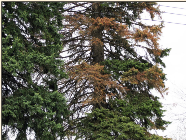
Branches killed by Cytospora canker.

Cytospora canker of spruce has become more common in landscape plantings and wind-breaks, probably because of additional stress in the trees caused by several years of drought. Colorado blue spruce is the species most commonly affected. Branches and sometimes the tops of trees are killed by the disease.