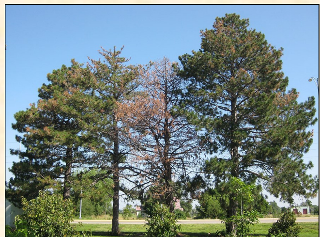
Austrian pines in decline from Diplodia blight.

Diplodia blight continued to kill and damage many pines in Nebraska in 2014 in both urban and rural landscapes. Mortality and damage most often occurred on Austrian and ponderosa pines. Stressed trees are more susceptible to the disease, such as those affected by drought and overcrowded stands, and urban landscape trees that have been poorly planted or poorly cared for.