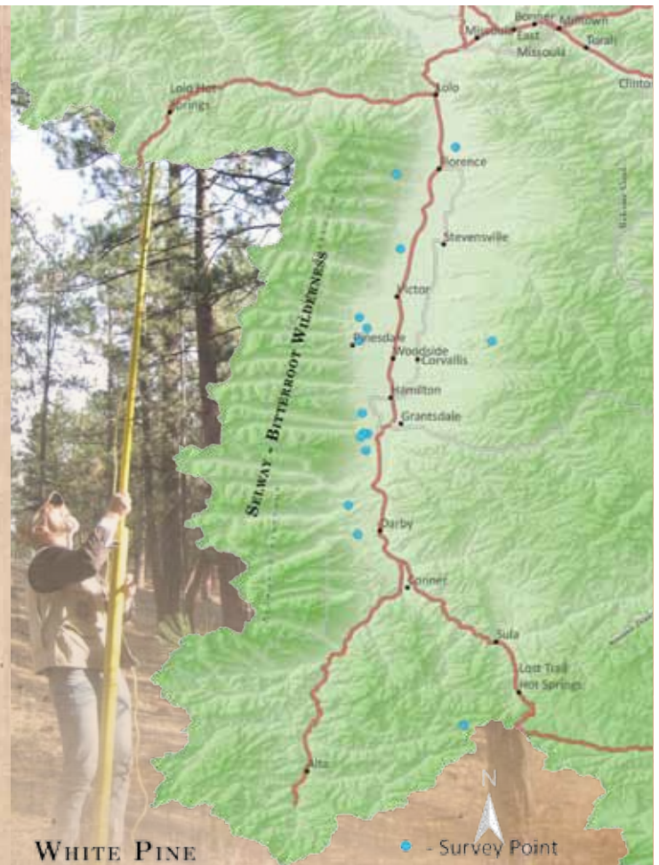
WHITE PINE BUTTERFLY EGG MASS SURVEY PLOTS - 2011

With the financial assistance of an FHM grant, the MT DNRC Forest Pest Management and Urban and Community Forestry Programs coordinated an outreach program to educate master gardeners, extension agents, nursery and tree care professionals, and natural resource managers on the threats of invasive insects in Montana. The curriculum focused on Asian longhorned beetle, emerald ash borer, sirex wood wasp, and gypsy moth and included important ecological characteristics, potential impact, and key diagnostic features. Thirty workshops were conducted throughout the state with well over 400 people attending.