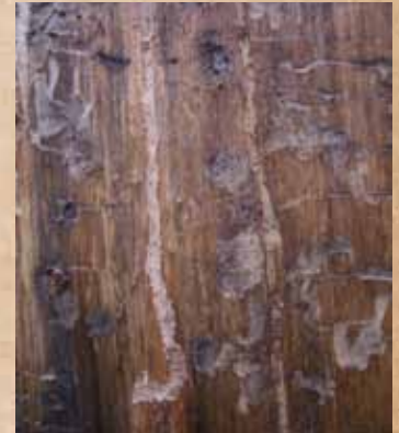
Mountain pine beetle gallery