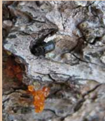
Adult mountain pine beetle

Mountain pine beetle continues to kill a significant component of whitebark pine in high elevation ecosystems. Effects of this mortality are compounded by the non-native, invasive white pine blister rust and fire exclusion.