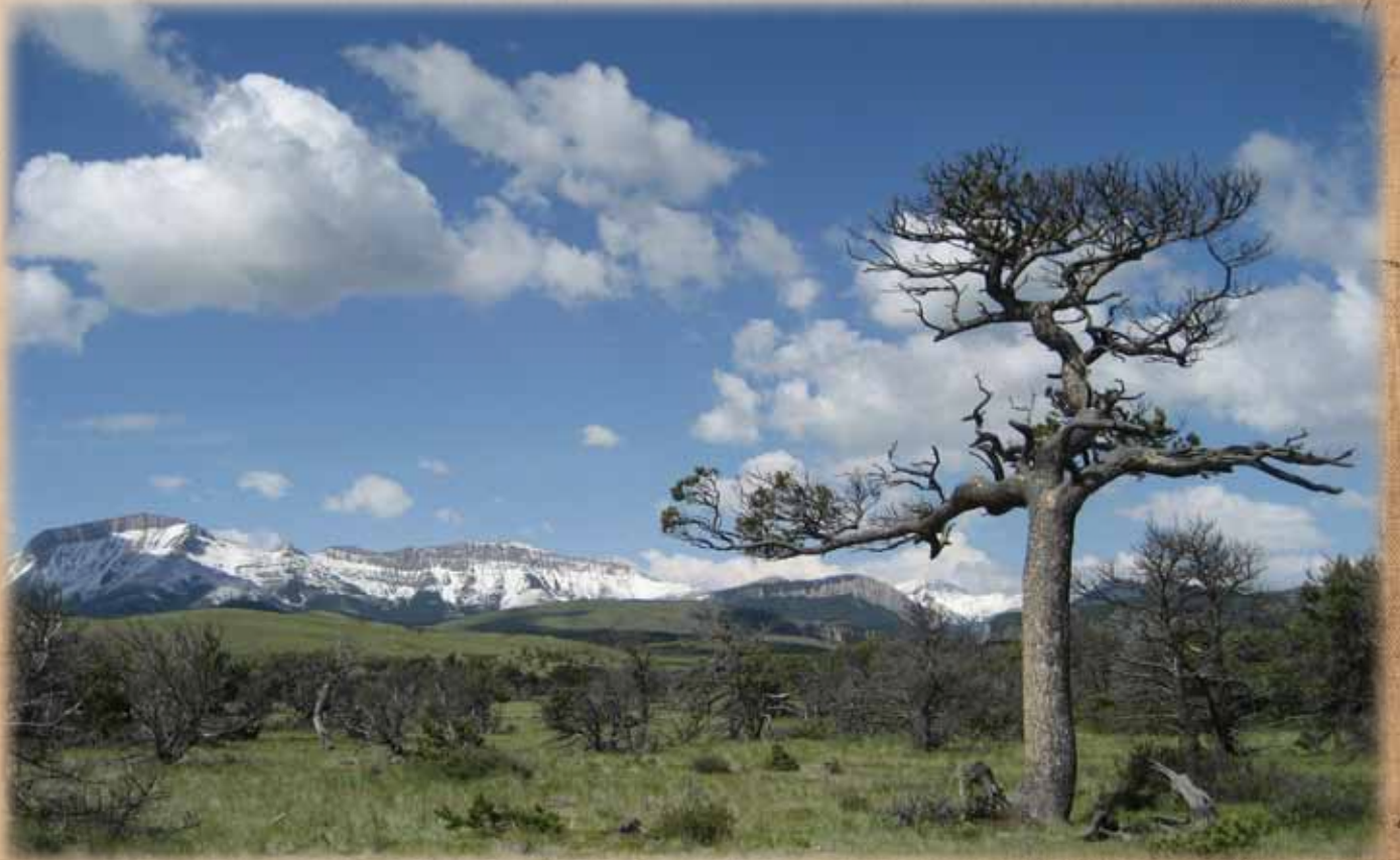
Limber pine outside Choteau, Montana.

Montana's diverse forests are primarily composed of Douglas-fir, five species of pine, various true firs, spruce, larch and aspen. Along with these diverse tree species comes an equally diverse array of insects and diseases. Healthy, vigorous forests are generally resilient to insects and diseases but outbreaks can indicate changing forest conditions. Montana forests have experienced recent drought, overstocking, significant changes in fire ecology and noteworthy outbreaks of insects and diseases. These are landscape level agents of change and while their intensity tends to ebb and flow, the cumulative effects may linger for decades. The forests today are in many ways different from those in years past.