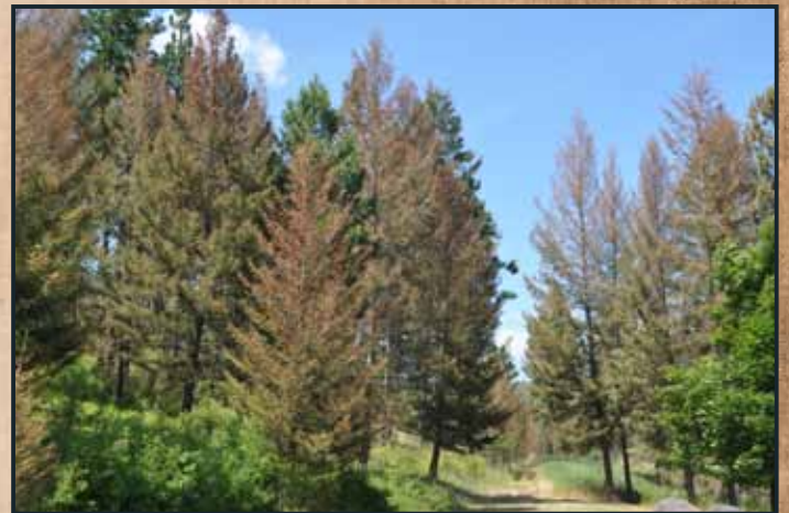
Defoliation caused by the douglas-fir-tussock moth

well. It is a much more aggressive defoliator and can kill trees more swiftly. Defoliation from DFTM was not detected from aerial surveys but ground surveys indicate increasing activity in Lake, Flathead, and Missoula Counties.