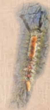
Douglas-fir tussock moth

Douglas-fir tussock moth (DFTM) is co-occurring with WSBW in some areas as