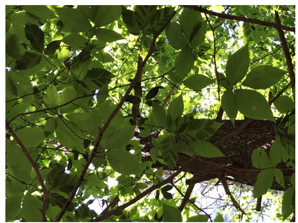
Caption. Beech leaf disease symptomatic American beech leaves- Plymouth, MA, June 2020.

Beech leaf disease was detected for the first time in Massachusetts in 2020. Infected American and European beech were found in Plymouth, MA- Plymouth County, in June 2020. An infected site was also confirmed in Dartmouth, MA- Bristol County. The DCR Forest Health Program will continue to survey and sample for the spread of this disease in the commonwealth.