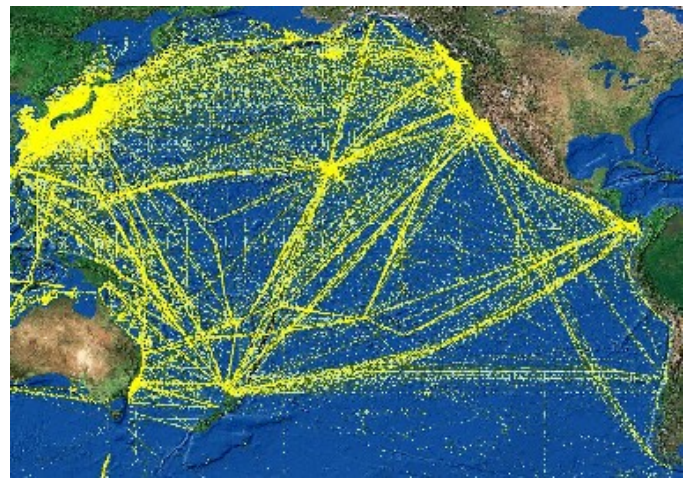
Hawaii's location in the center of shipping routes in the Pacific is increasing the inadvertent movement of invasive species.

More than 8,000 plant species and cultivars have been introduced into gardens and other areas in Hawaii. Over half of Hawaii's current flora of 2000 or so flowering plants are nonnative, naturalized species and almost ten percent of these represent serious threats to Hawaii's native ecosystems. Many plant communities are now dominated by introduced species and some species, such as strawberry (Psidium guava guajava), form monospecific stands over large areas of The sheer number of the State. invasive species coupled with Hawaii's resource-based economy results in a significant economic impact to the State. Trade is increasingly global and it is unlikely that it will decrease in the near future. We can, therefore, expect the