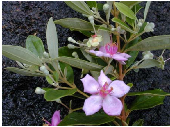
Early detection and rapid response was responsible for the possible eradication of downy rose myrtle ( Rhodomyrtus tomentosa ) on Maui.

Downy rose myrtle is an attractive ornamental often spread by gardeners. It can be found in moist and wet forests and bog margins, up to 3000 ft. elevation in Hawai'i. Although widespread on Hawaii and Kauai, a recent early detection and rapid response on Maui eradicated the three known populations there. Monitoring for new infestations continues on Maui. Local eradication of downy rose myrtle is occurring in Kokee State Park on Kauai. On the rest of Kauai and on Hawaii, populations continue to spread unabated.