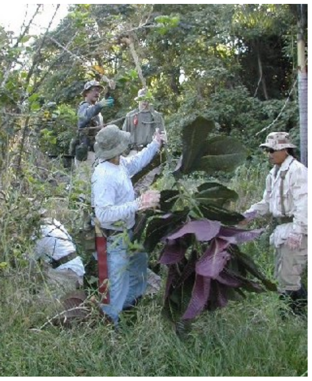
Crews from the Big Island and Maui Invasive Species Committees continue control of Miconia calvescens , Hawaii's top priority forest weed.

The rampant spread of this introduced plant on Tahiti, where it occurs on over 65% of the island and forms dense monospecific stands on 25% of the island, alarmed conservationists and biologists in Hawaii. Agencies and individuals long interested in invasive species control in Hawaii galvanized around the threat of miconia and other melastome species in the early 1990's, forming Melastome Action Committees on Maui and Hawaii. Miconia continues to be the highest priority weed for control in Hawaii. Miconia threatens mesic and wet habitats in Hawaii that receive more than 75 to 80 in. of annual rainfall. Trees flower after only 4 to 5 years and a single large (30 ft.) mature tree is capable of producing up to 3 million seeds several times a year. Seeds are dispersed by birds and pigs. It currently occupies large acreages on Hawaii (110,000) and Maui (30,000) where control strategies focus on stopping the spread of miconia (containment) with some reduction of the core population (on Maui). The Maui Invasive Species Committee surveyed 34,000 acres for miconia and treated 236,000 plants on 135 acres of