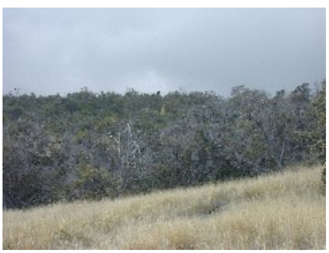
Fountain grass, Pennisetum setaceum , covers over 200,000 acres on the island of Hawaii, increasing fire potential and severely impacting critically endangered dry forests.

Pennisetum setaceum (Forssk.) Chiov. Fountain grass is a fire-adapted introduced grass that is changing fire outcompeting regimes and native species in Hawaii. It covers more than 200,000 acres on the island of Hawaii, threatening the remaining dry forest communities on leeward slopes. Efforts to control or eradicate fountain grass are on-going on Kauai, Lanai, Maui and Oahu where it is present in limited Conventional control is not extent. deemed feasible on Hawaii. Current research on forest restoration techniques holds promise for replacement of fountain grass with native understory species and ecosystem restoration on a landscape level. Reduction in fountain grass cover would also reduce fire occurrence in some of Hawaii's most fire prone areas. Conventional biological control is also being explored by the Hawaii Department of Agriculture.