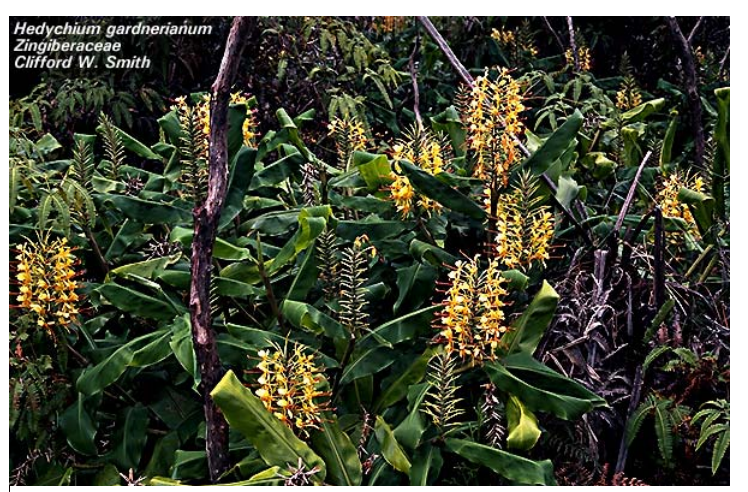
A bio-herbicide is under development for the control of kahili ginger, a serious pest of wet forests.

Kahili ginger is an attractive herb with showy yellow flowers which arows over five feet in height. It is currently invading wet forest on Lanai, Kauai, Hawaii and Maui and can form dense, monospecific stands, even in closed forests. Efforts to control Kahili ginger in localized areas are on-going at Hawaii Volcanoes National Park on Hawaii and at Kokee State Park on Kauai, with some successes. In addition, the U.S. Geological Survey is conducting studies on the efficacy of a bacteria used as a bio-herbicide and its potential for more widespread control of kahili ginger.