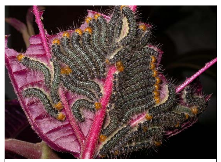
Larvae of Euselasia chrysippe , a promosing biological control agent for Miconia calvescens , causes severe defoliation during host testing in Costa Rica.

Efforts are also underway by the U.S. Forest Service and "in-country" collaborators to search for biological control agents in the native range in Brazil and Costa Rica. Promising agents include а defoliating caterpillar (Euselasia chrysippe, Riodininae), a shoot-feeding psyllid (Diclidophlebia lucens, Psyllidae), a stem-mining weevil ( Cryptorhynchus melastomae, Curculionidae), a fruit borer (Anthonomus monostigmata. Curculionidae), a leaf pimple fungus (Coccodiella miconiae. Phyllachoraceae) and a leaf and shoot-galling nematode (Ditylenchus sp.).