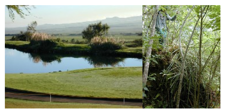
Many of Hawaii's worst weeds were introduced as attractive ornamentals and are still used for residential or commercial landscaping. These plants later invade native forests and become conservation problems.

Cortaderia jubata is both a Federal and Hawaii listed noxious weed and is considered a serious pest in New Zealand and California. On Maui it has naturalized and, although the acreage infested is still limited, it exhibits a wide ecological tolerance ranging from laoValley on West Maui to Haleakala Crater on East Maui at elevations from 2,000 ft. to almost 7,000 ft. Efforts at controlling this species on Maui continue but have proven to be difficult and long-term. This species is targeted for local control and eradication on Kauai, Hawaii, and Molokai. On Oahu it is only known from ornamental plantings. Efforts at encouraging voluntary removal or ornamental plants are underway. A related species of pampas grass that is very similar in appearance but less invasive species, C. selloana , is present in Hawaii and is also used extensively in landscaping.