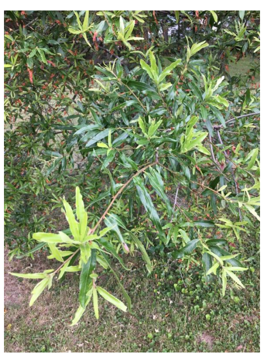
Figure 1. A June 27, 2020 picture of willow oak in Kent County, Delaware shows chlorotic leaves likely due to a very wet and frosty spring.

The 2019/20 Delaware winter was very mild. All-winter lows for most of the state were only around 15 degrees F. Snow fall totals were near record lows. The spring was cool, with late frosts recorded April 17, 19 and around Mother's Day (May 10). The cool frosty spring appeared to cause some leaf necrosis and chlorosis. Some flowers appeared damaged, and then later, fruit damage became apparent on some species. A period of heavier than normal rains interspersed with hot days in the 90's affected July, August and September. Also, a record long tornado path on August 4<sup>th</sup> did severe tree damage to trees for 29 miles from south of Dover to north of Middletown.