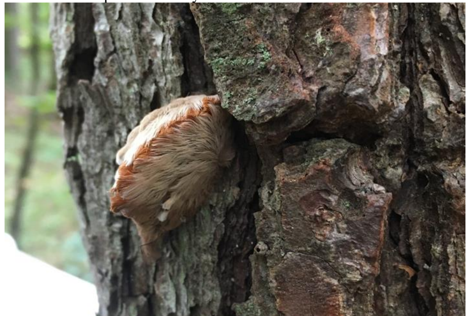
Figure 3. An unidentified caterpillar (noted but not touched!) on loblolly pine in Sussex County, summer 2020.