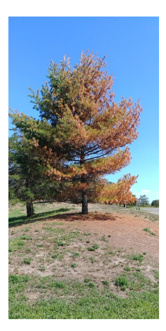
Damage from wind-blown salt water during TS Isaias, August 2020.

Late in the season, hardwood anthracnose caused browning and defoliation of many species, especially maples, in the western counties of CT. Heavy seed set in maples caused canopy discoloration in some areas of Litchfield county in late summer.