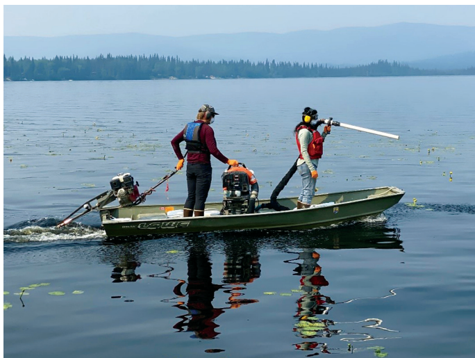
Figure 13. FSWCD staff work to eradicate the invasive aquatic plant Elodea in Birch Lake, near Fairbanks.

In the continuing battle to control aquatic Elodea, it is noteworthy that Elodea eradication has been achieved in two water bodies and no new infestations were found in 2022. The Alaska Department of Natural Resources (ADNR), the U.S. Fish and Wildlife Service, and the Fairbanks Soil and Water Conservation District (SWCD) surveyed 200 water bodies for Elodea with zero detections. Meanwhile, the Fairbanks SWCD continued to treat 26 water bodies (Figure 13) and ADNR treated 3 water bodies in the Anchorage area in ongoing Elodea control efforts.