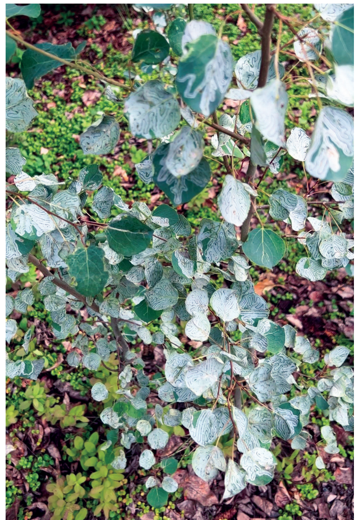
Figure 18. Heavily defoliated aspen saplings were commonly observed in urban settings and along major roadways in the Interior.