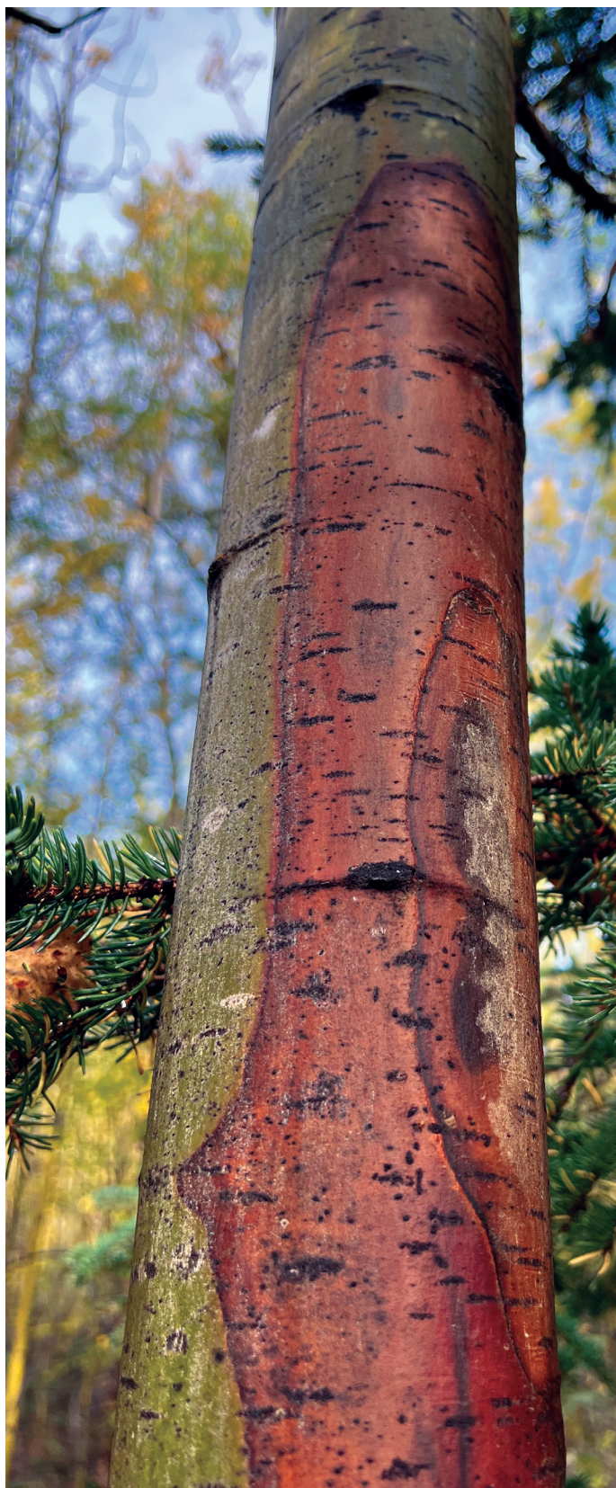
Figure 8. Aspen running canker ( Neodothiora populina ) on the Resurrection Pass Trail on the Kenai Peninsula.

Phellinus species produce perennial conks and cause white trunk rot of hardwoods. Recently, Phellinus igniarius has been