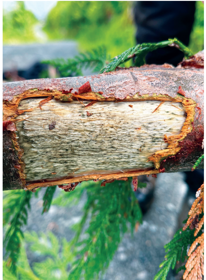
Figure 11. A fresh, fibrous wound on a 30-year-old western redcedar crop tree near Rush Creek on Prince of Wales Island.