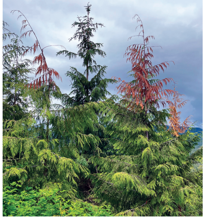
Figure 10. Western redcedar trees with topkill damage in a managed young-growth stand near Rush Creek on Prince of Wales Island. There were numerous topkilled and wounded trees in this unit initially harvested in 1992.

Western redcedar topkill (Figure 10), which is associated with girdling stem wounds, was investigated with roadside surveys and destructive sampling. We sampled 15 affected trees on Prince of Wales Island, documenting the number, height, and size of wounds, and collected wounded stem sections. Wounds occurred seven to 31 feet from the ground on parts of the stem less than 4 inches in diameter. Apparent toothmark grooves were visible on fresh wounds (Figure 11), which are most likely caused by feeding or bark collection activity of northern flying squirrels. The cause is still under investigation. Although the island hosts a distinct squirrel subspecies, the Prince of Wales flying squirrel, the damage has also been noted on Revillagigedo and Wrangell Islands where the broader species occurs.