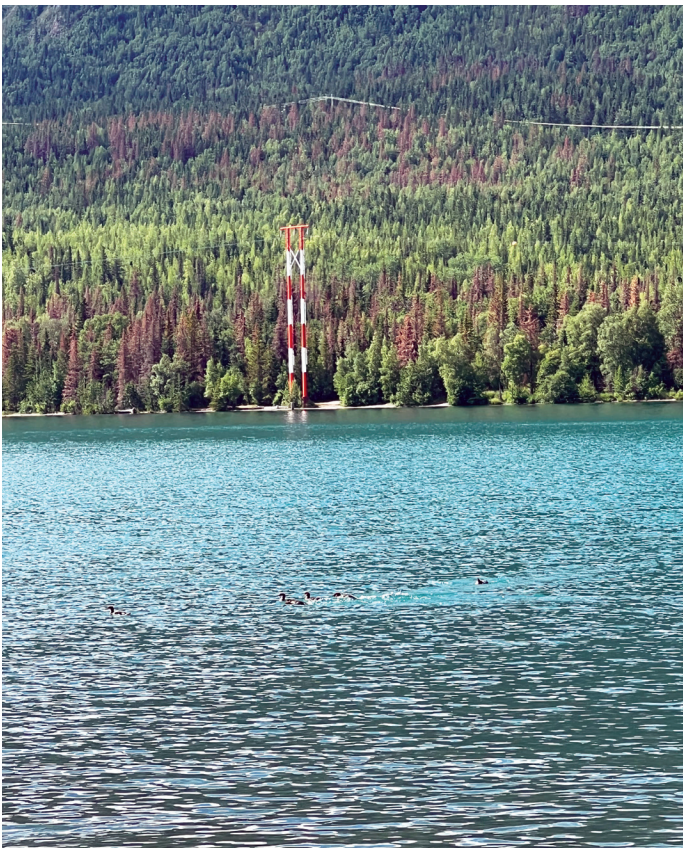
Figure 17. Spruce beetle damage along Snug Harbor Road in the Cooper Landing area, viewed across Kenai Lake.

Aspen and birch leafminer continue to be the most damaging agents in the Interior, despite lower acreage recorded during aerial detection surveys. Ground detection surveys confirmed heavy defoliation predominately caused by two birch leafminer species in the Fairbanks North Star Borough: late birch leaf edgeminer and amber-marked birch leafminer. Aspen leafminer damage (Figure 18) was detected along every major roadway in and out of Fairbanks, with damage tapering in severity towards the Brooks Range, the Alaska Range, and the Canadian border.