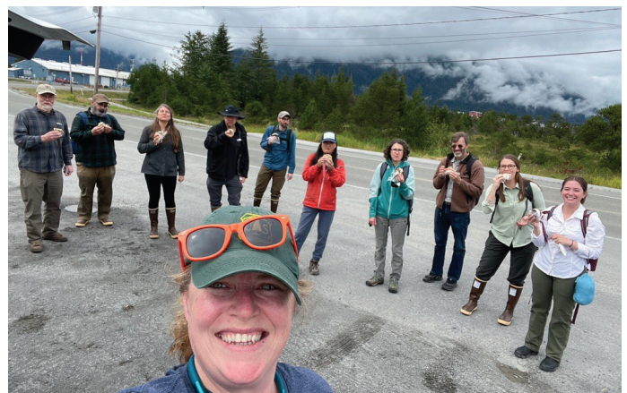
Figure 15. Forest Health Protection team members met in Petersburg, AK to conduct ground detection surveys for defoliating insects. The group spent time together calibrating how to measure damage and enjoying time in the field (with ice cream sandwiches for fuel)!

A ground survey was conducted across the road systems of Southeast Alaska to determine the status of the insect populations and damage from the ground. This also served as a team-building opportunity for the Forest Health group with some members meeting for the first time in person (Figure 15). Additional surveys off the road system were conducted by Alaska Youth Stewards on