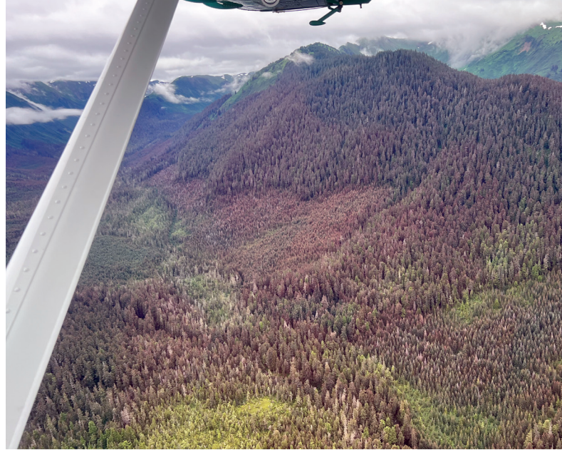
Figure 14. Western blackheaded budworm defoliation in old and young growth forests near Excursion Inlet.