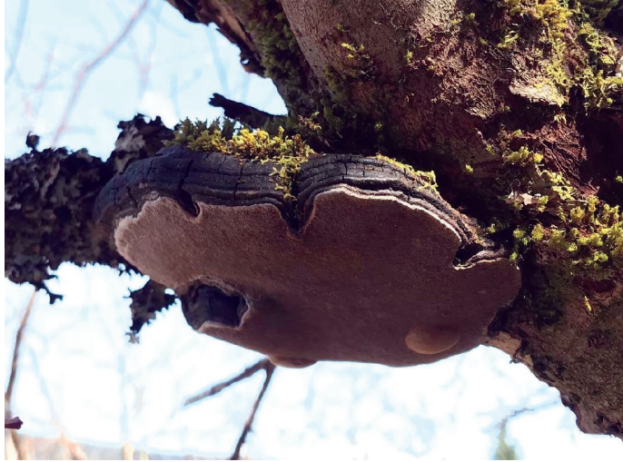
Figure 9. An uncommon Phellinus sp. conk on willow at Pt. Bridget State Park north of Juneau.