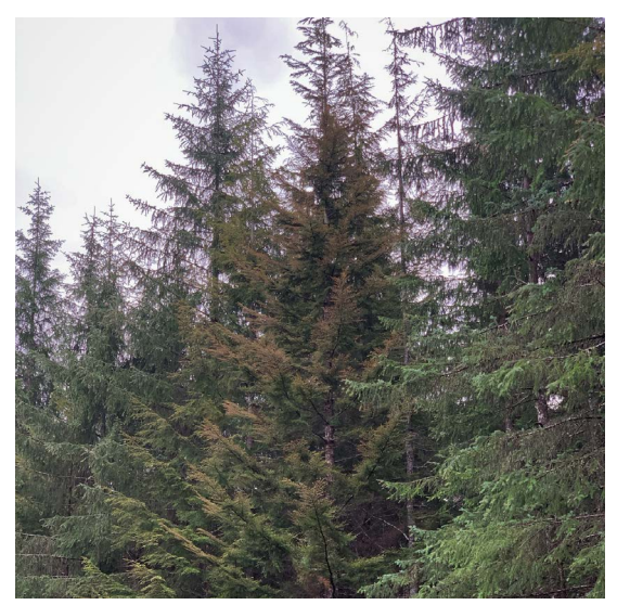
Figure 4 Western blackheaded budworms feed on the new foliage of western hemlock and other conifers leaving the trees with a reddish appearance.