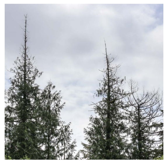
Figure 3 A group of western redcedar trees on Prince of Wales Island with dieback and topkill symptoms associated with severe drought.