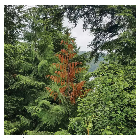
Figure 2 | A western redcedar tree with fresh topkill.