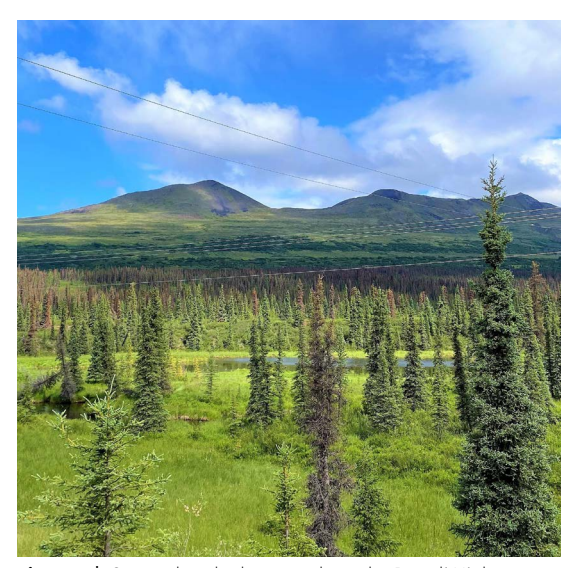
Figure 6 | Spruce beetle damage along the Denali Highway near Cantwell.

Observations over the past several years suggest that there are two distinct causes of western redcedar damage, which is concentrated on Prince of Wales Island in Southeast Alaska. The first cause is topkill associated with bole injury of unknown cause (Figure 2). The second cause is direct impacts of the drought of 2018 and 2019 (Figure 3). In Southeast, the return of adequate precipitation over the past two years will limit drought damage in the near-term, though impacts have continued elsewhere in the Pacific Northwest. There is a range-wide effort to track forest health issues of western redcedar.