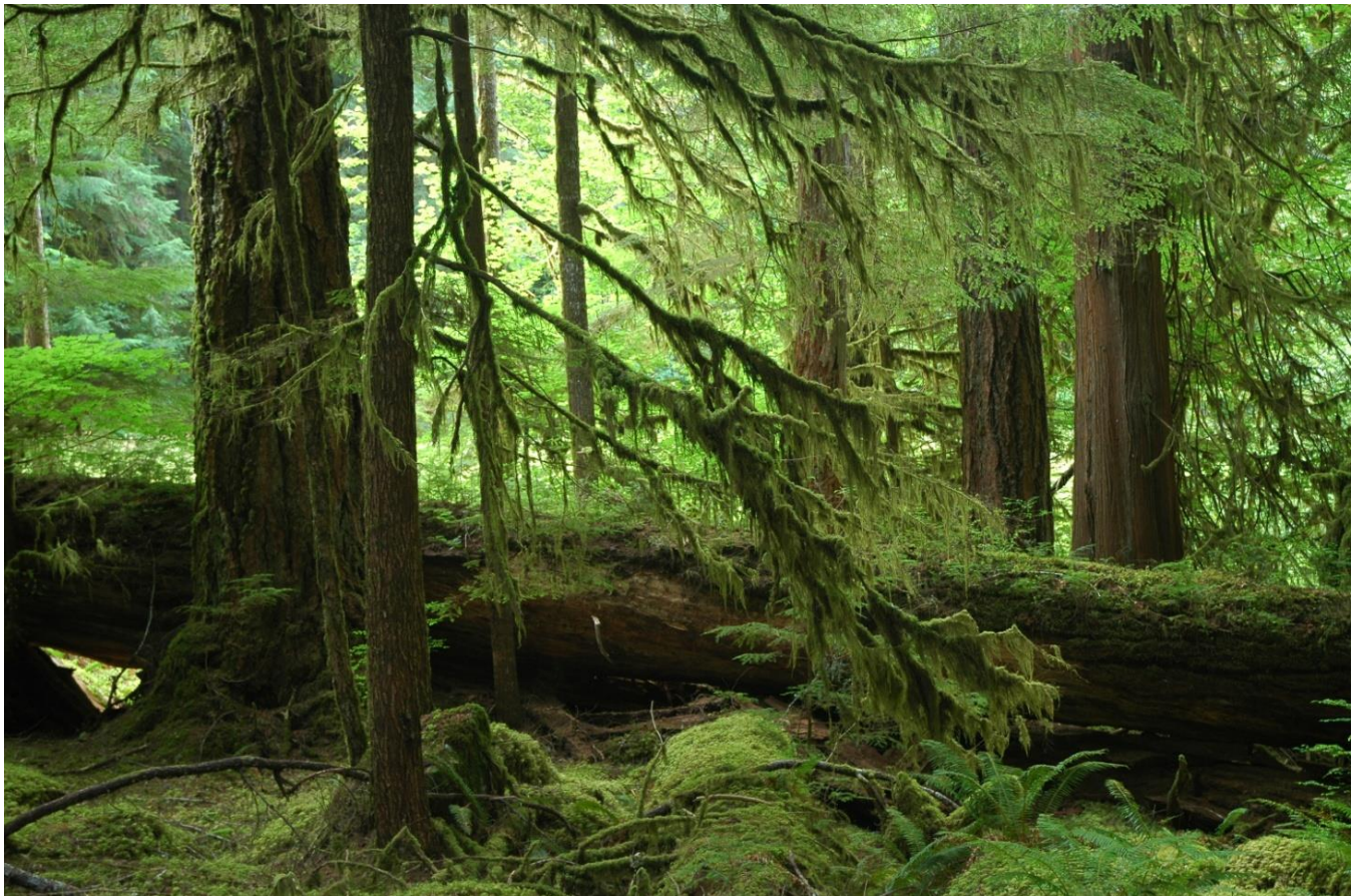
Sol Duc Valley, Olympic National Park (Stephanie Rebain, FS-WOD-FMSC)