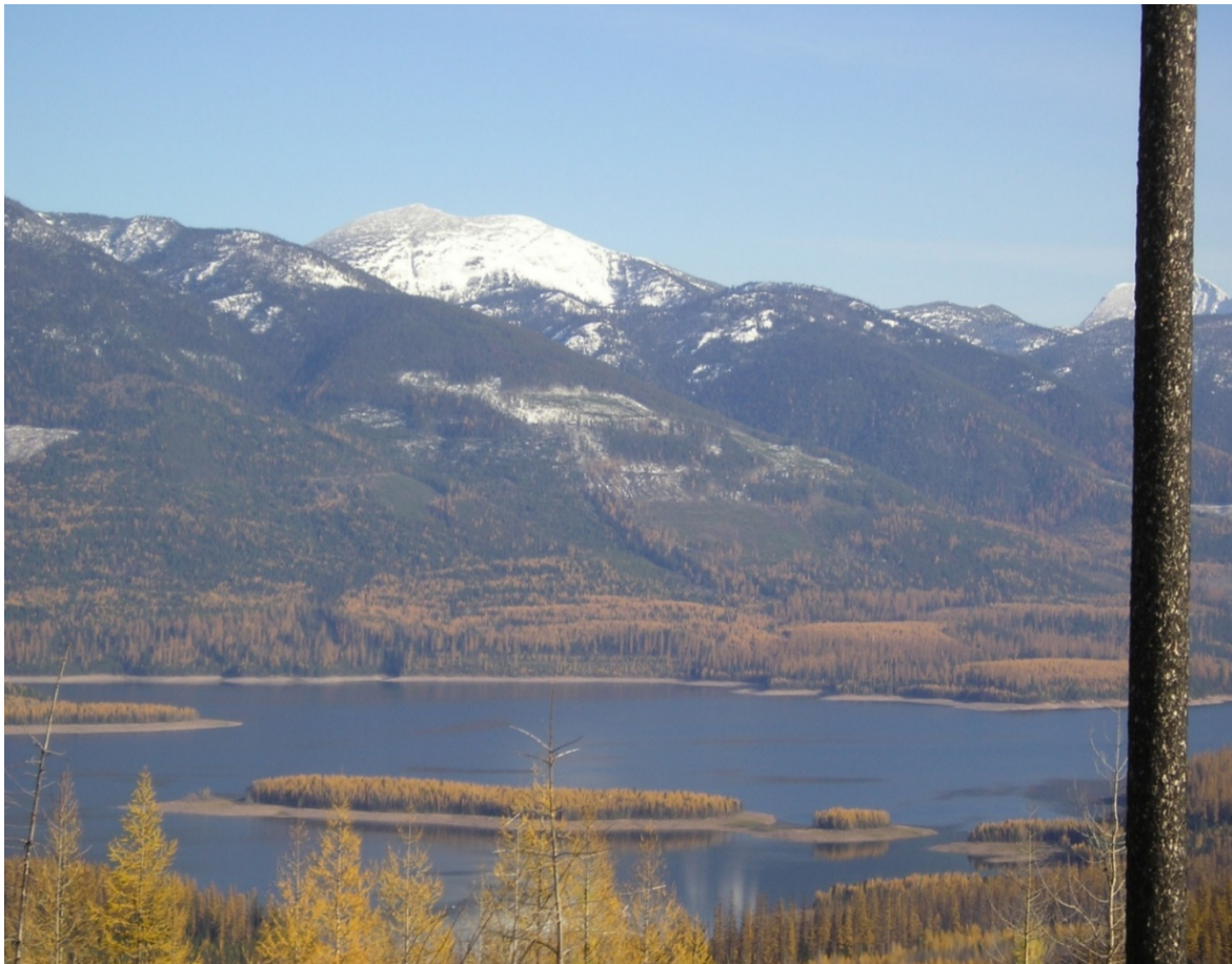
Flathead National Forest