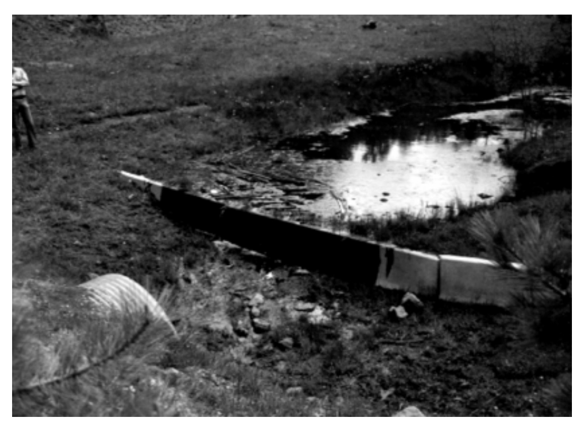
Figure 3—Jersey barrier gully plug.