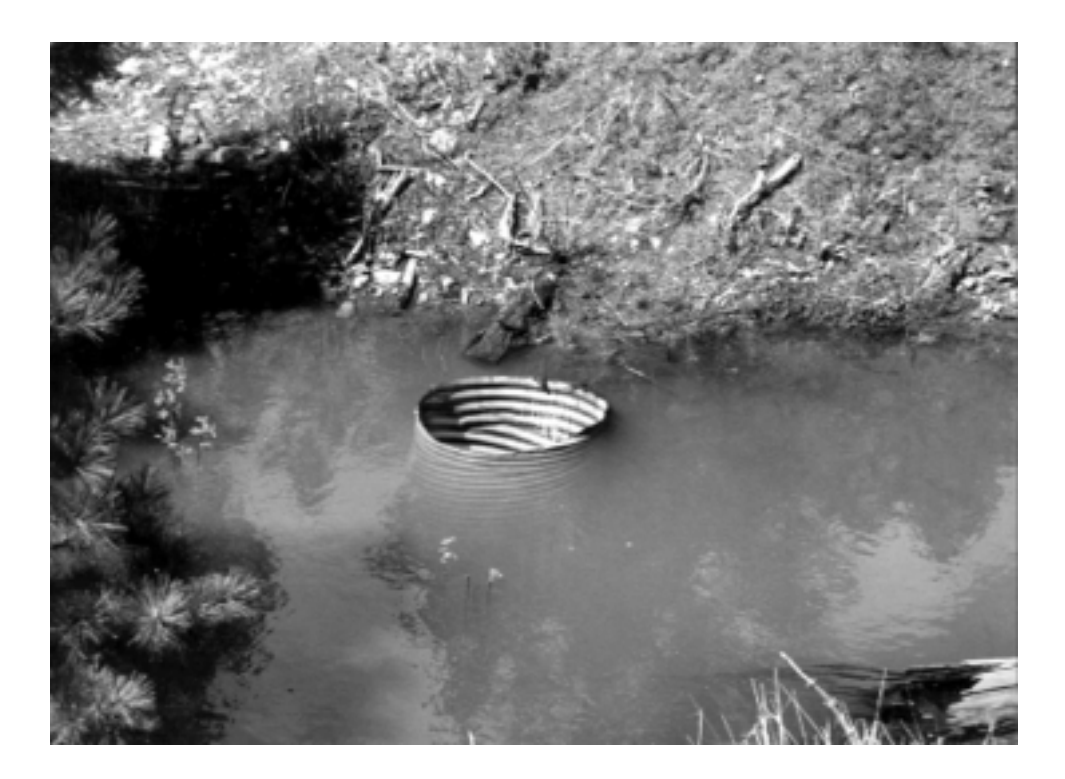
Figure 1—Elbow installed on cross drain to pond water and preserve sediment.

Surface Drainage includes the interaction of water with road surface features including cut and fill slopes, travelway surfaces, leadout and other ditches, cross drains and water bars, and other road-surface-related drainages. See figure 1 for a cross drain application. Alternative road surface shapes, surfacing materials, and maintenance techniques fall under this component, as do most erosion and many sedimentation concerns. Concentration of water and risk assessment are inherent in this component.