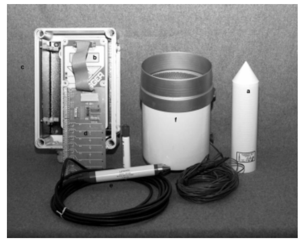
Figure 2—Equipment used for monitoring the effects of roads on groundwater piezometric surfaces. (a) PVC well tip. (b) Unidata Starlogger. (c) Weatherproof enclosure. (d) Field termination strip. (e) Hydrostatic pressure transducer. (f) Tipping bucket rain gage.