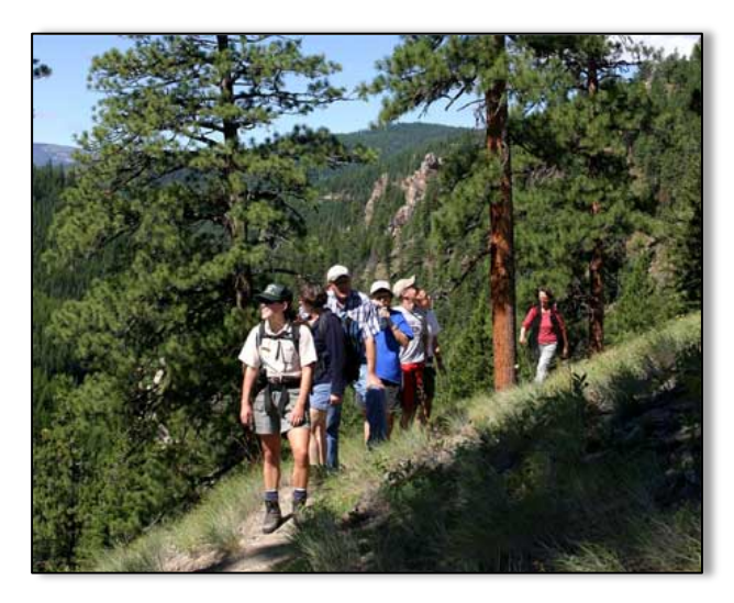
Hikers on the Lolo National Historic Trail.