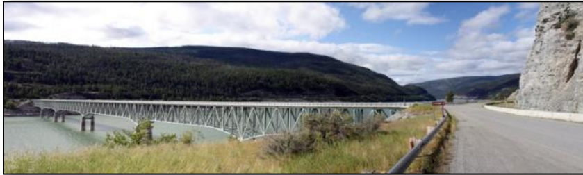
Lake Koocanusa Bridge