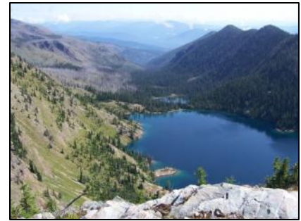
Cabinet Mountain Wilderness