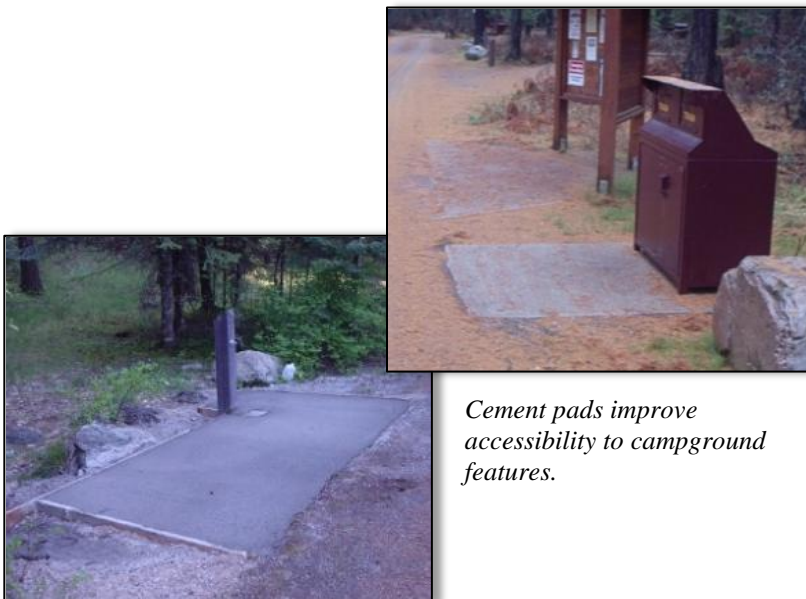
Cement pads improve accessibility to campground features.

*Carryover funds will be used for large projects and the following season's startup costs.