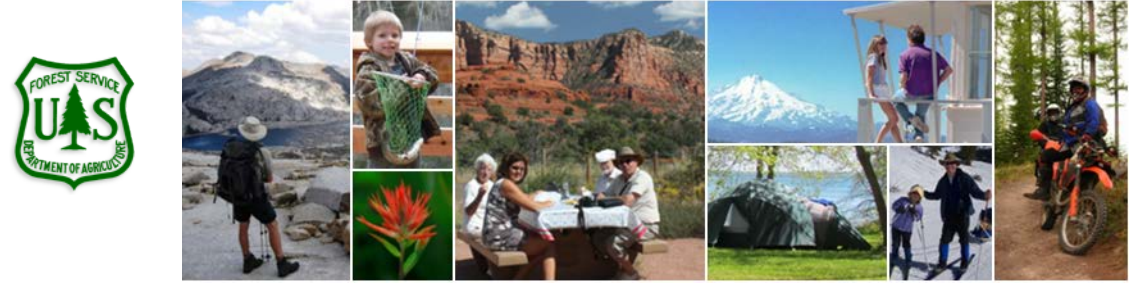
Recreation fees are an investment in outdoor recreation. Current and future generations will benefit as 95% of the funds are reinvested in the facilities and services that visitors enjoy, use, and value.