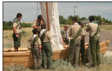
Boy Scout Troop #466 raise the sail on a replica bateau they dedicated to the Interpretive Center.