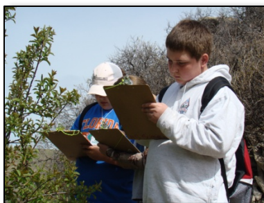
7 th grade students from Great Falls identify shrubs during Field Investigation Day.