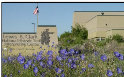
Lewis and Clark National Historic Trail Interpretive Center