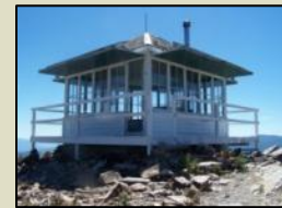
Kootenai National Forest Revenue & Expenditures

Sitting at an elevation of 5,798 feet, the Sex Peak Lookout offers incredible views of Clark Fork Valley and the surrounding area. Originally constructed in the 1920's and replaced in 1948, the current lookout was retired from service in the 1970's. Since then, it's become a popular destination for visitors interested in a rustic getaway. In 2011 with recreation fee funds, this popular rental received vital repairs that included a new roof, shutters and lightning protection system.