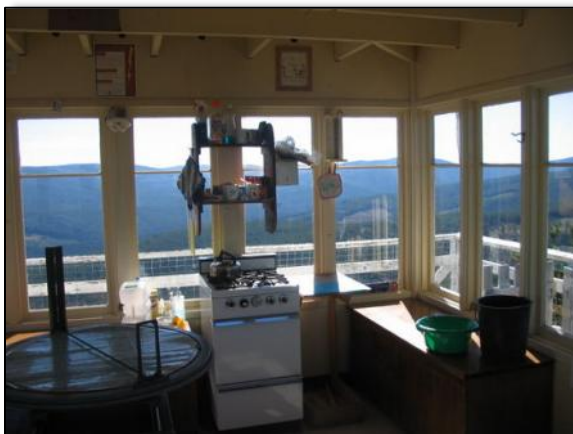
Big Creek Baldy Lookout