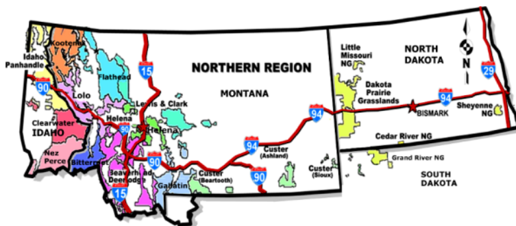
Northern Region Recreation Sites

A fee is charged at 20% of the Developed Recreation Sites in the Northern Region.